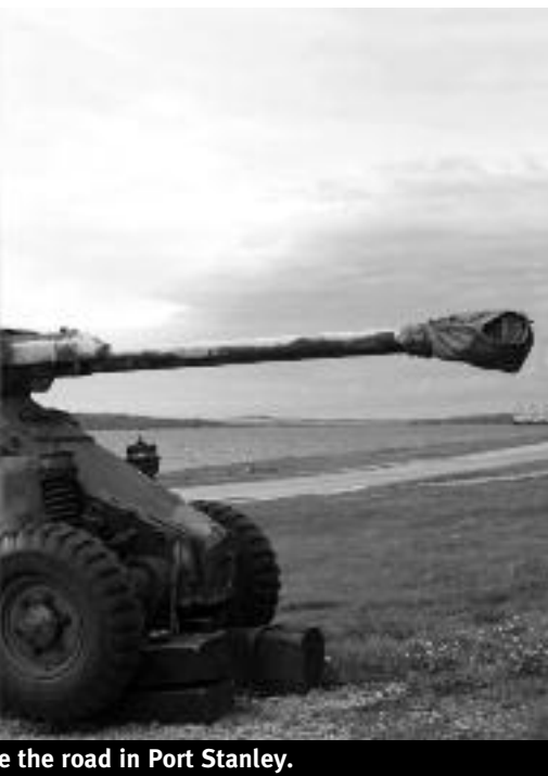
e the road in Port Stanley.

finding oil fields in the area will only be a complicating factor and increase tensions further.