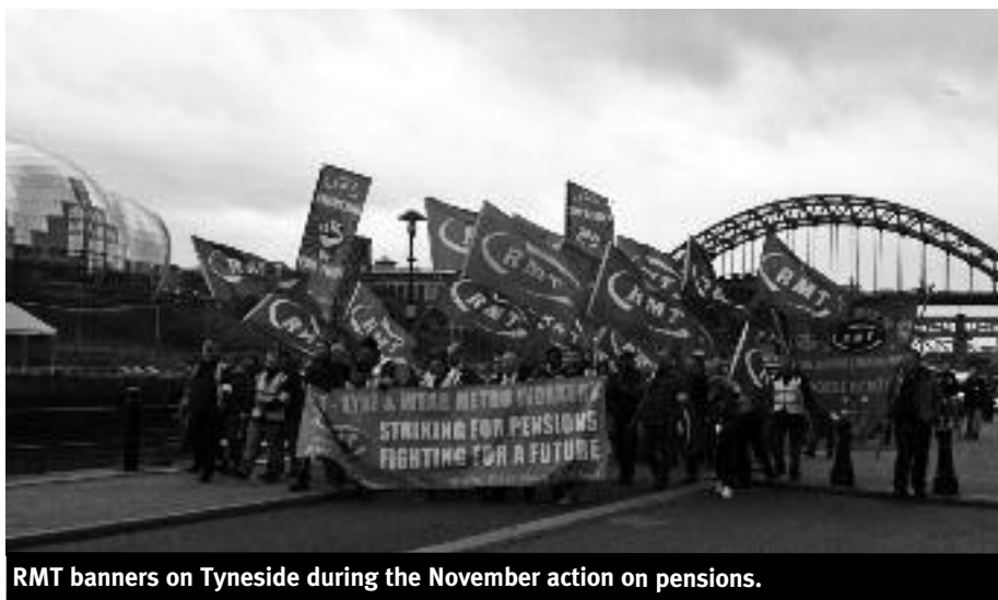
RMT banners on Tyneside during the November action on pensions.

This article is an edited version of a speech given at a CPBML public meeting in London in February.