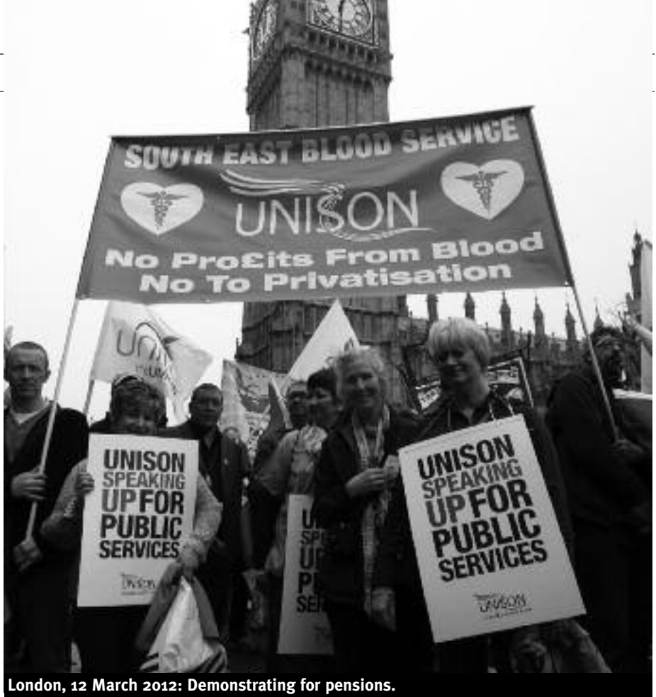
London, 12 March 2012: Demonstrating for pensions.

Some union leaders want to be commentators on the Westminster theatre