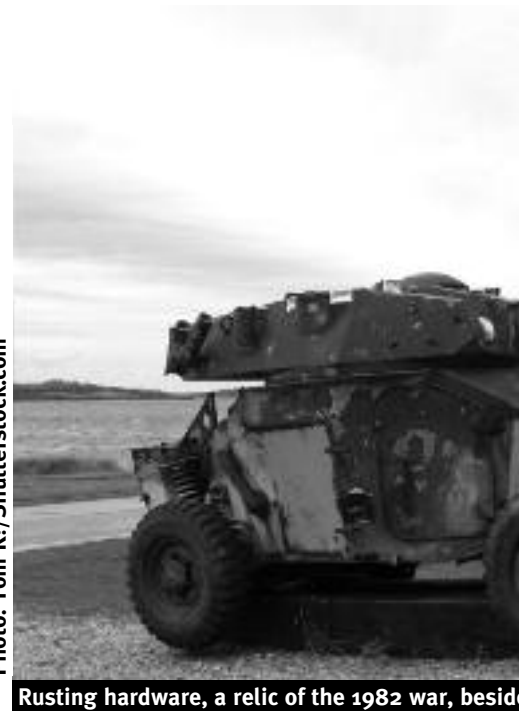
Rusting hardware, a relic of the 1982 war, beside

unpopular, but the chauvinism and phony nationalism of the Falklands War brought her an unlikely khaki election victory in 1983 that allowed her to go ahead with her vicious war against British workers' jobs, wages and unions.