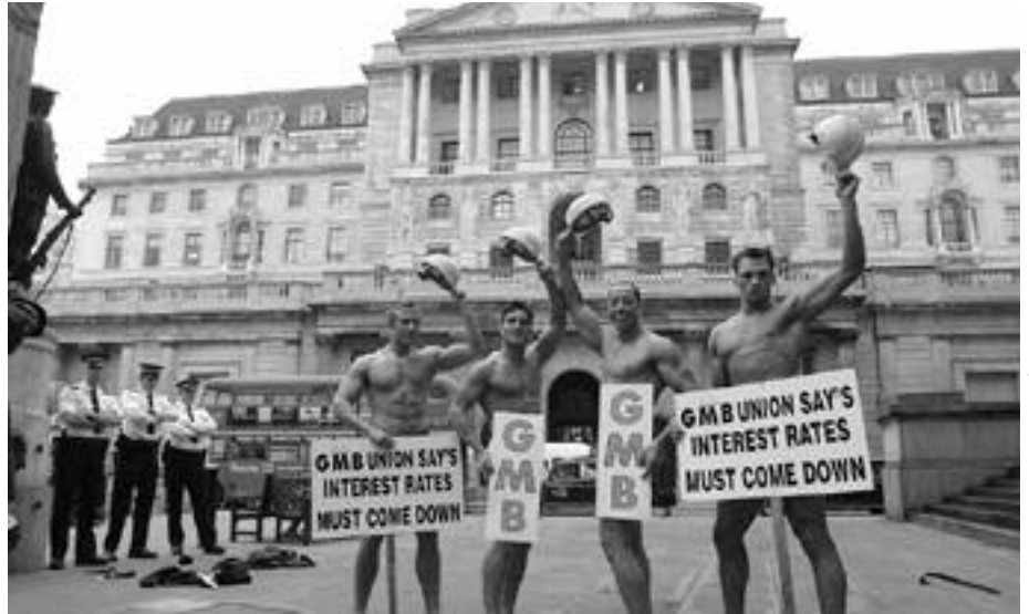
GMB members made redundant from manufacturing industry make their stand outside the Bank of England during December's monthly interest-setting meeting.

Baird is still in legal dispute with Marks & Spencer over the loss of its contracts. Already 4,000 jobs were lost, and it is doubtful if the buy out will mean any more jobs.