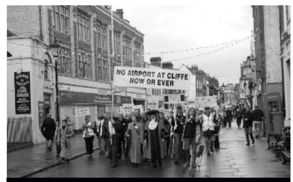
PEOPLE OF NORTH KENT on the march in Chatham last month on a wet Saturday, demonstrating against proposals to site an international airport at nearby Cliffe. Campaigners say that the airport would cost over £16 billion, destroy nature reserves and have a major impact on the environment. Most of the affected boroughs, and a large majority of North Kent's residents, are against the plans. Cliffe is closer to the Continent than to the North of England, raising concerns that part of the inspiration for the project may be simply to provide an entry route into Europe.

Yet again the proposed protocol has been hastily shelved in face of criticism from civil liberties organisations. But it has been merely shelved and could easily be dusted off and presented again (as has happened in previous years), until the US eventually gets its way. If implemented this would extend the terms of the US Patriot and Homeland Security Acts, which essentially set up a police state, to countries within the EU.