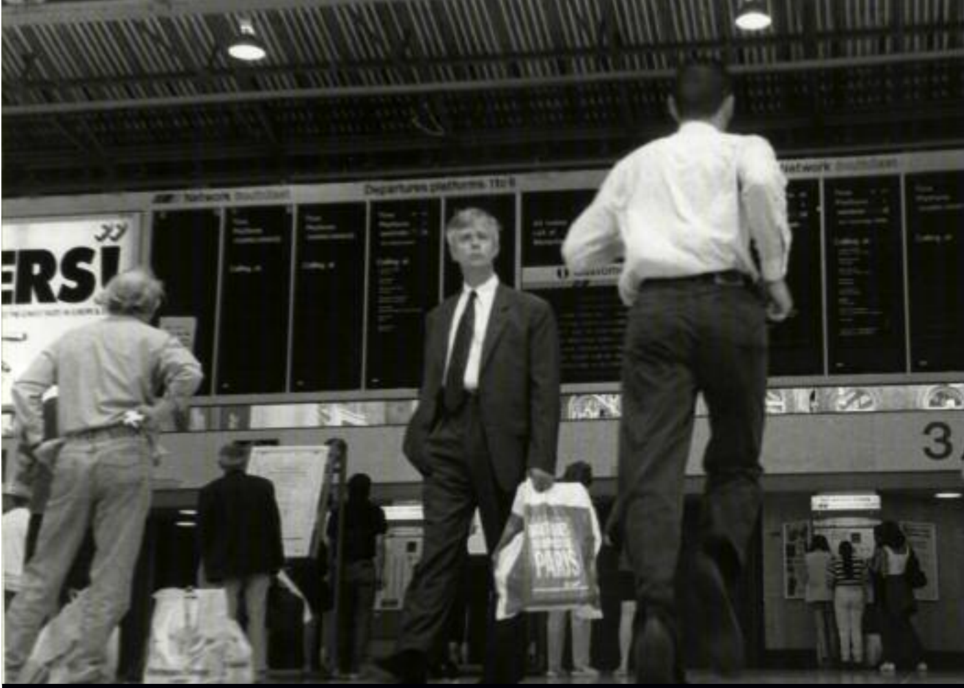
Harassed commuters in Charing Cross station: and they said things could only get better...

cool f9 billion overspent, and still won't deliver a railway capable of allowing Virgin's new Pendalino trains to reach their 140 mph design speed. It would have been cheaper to build a brand new TGV railway up the middle of the country than it has been to upgrade the West Coast line.