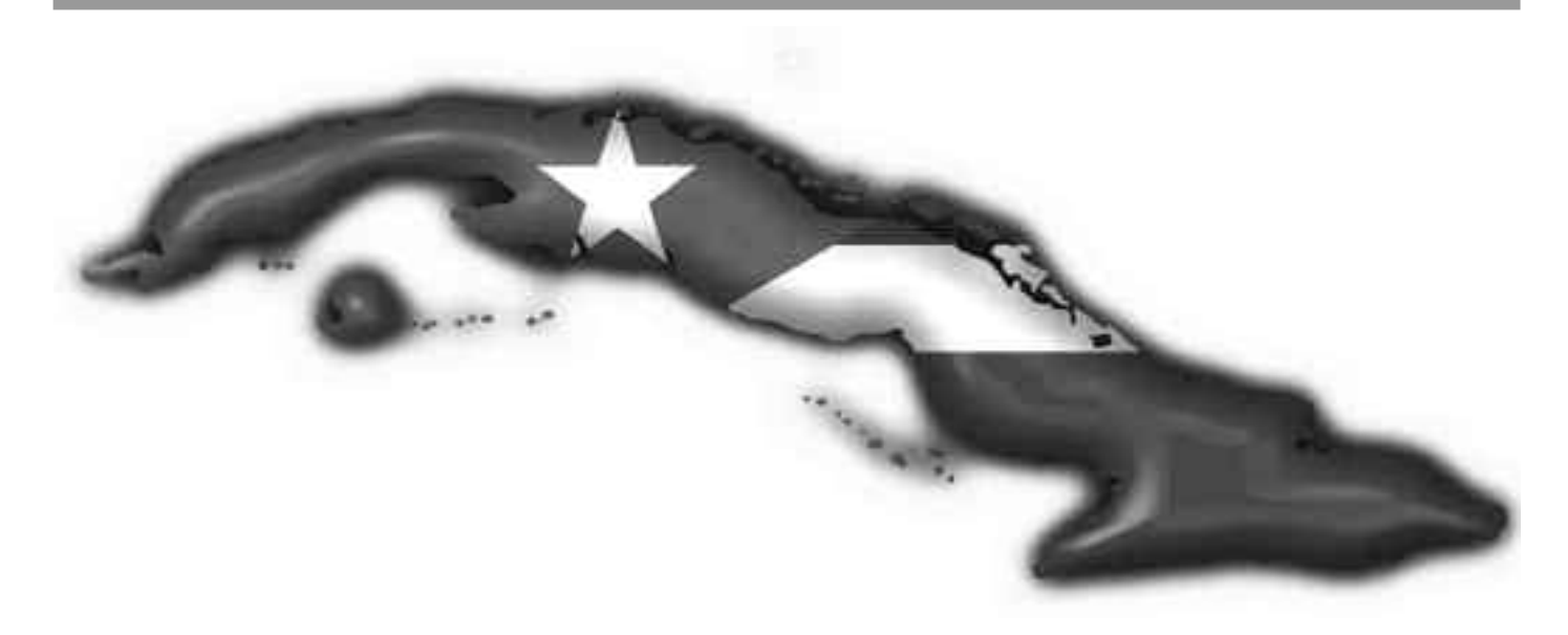
Small country, powerful ideology: Marxism enabled Cuba to survive a 40 per cent drop in production.

WITHOUT A working class alternative to capitalism, there is the probability that we will get dragged down with capitalism and face disaster. Such alternatives do not magically appear. They must be fought for by workers and they will come about only by a working class taking responsibility for its own future. It may sound a hard thing to do but there are examples of workers taking responsibility for their own future that we can learn from.