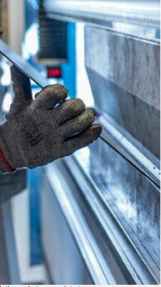
iatives – but none relate to pay.

the UK is that lending and investment still have not even come close to their pre-crisis rates and this has forced some companies especially SMEs to hire cheap labour instead of buying new machines that would make them more productive," it said.