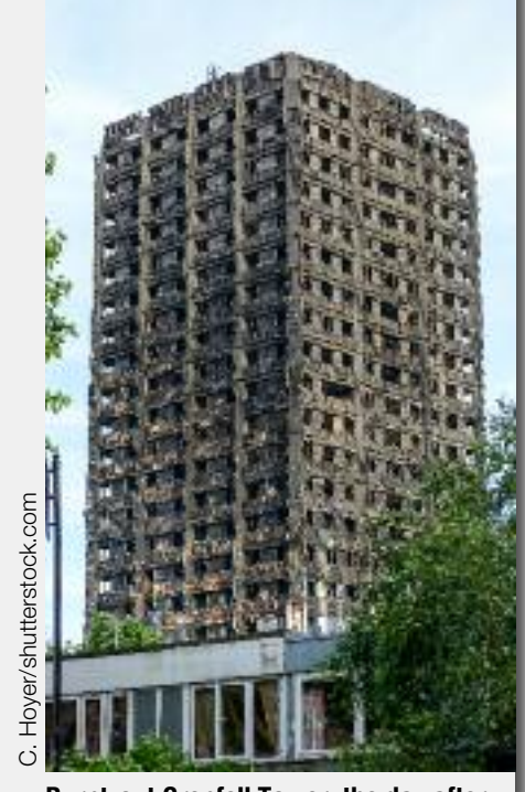
Burnt-out Grenfell Tower, the day after the fire.

Grenfell the council role of Construction and Design Co-ordinator (architects department) was in effect abolished, and regulations were changed to make the Tenants' Management Organisation responsible for health and safety.