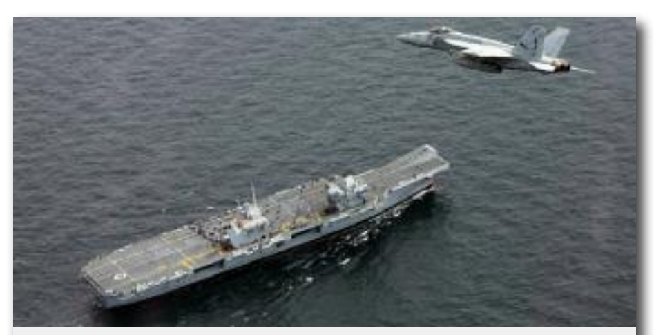
Neat symbolism: US Navy fighter flies over the new HMS Queen Elizabeth.

At the same time, any steps to strengthen joint trade union unity – NEU, Unison, GMB (and Unite to a lesser degree) – within the workplace and against the employer will be positive. Rivalry and competition only leads to division and failure. Unity and new tactics have to be the order of the day.