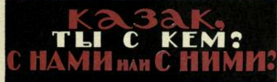
Poster from around 1919 calling on people to take sides. Translated it reads, "Cossack, who are you with? With us or with them?" – the question is asked by the Bolshevik peasant, soldier and worker.

counter-revolution grounded in the heartlands of capitalism – London, Washington, Berlin, Paris.