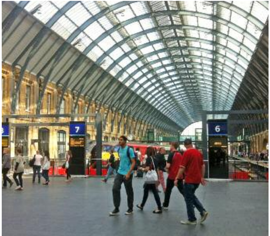
Passengers at King's Cross Station, London

Virgin the need to make nearly £2 billion in payments to the Treasury. It wasn't missed by the stock market though – the announcement saw shares in Stagecoach shoot up by 13 per cent.