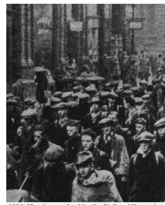
1934: March organised by the National Unemploye

During the war the government, rather than employers, controlled manpower, wages and working conditions through the Emergency Powers (Defence) Act passed in 1940. Strikes were deemed illegal under wartime Defence Regulations on the argument that the nation needed the