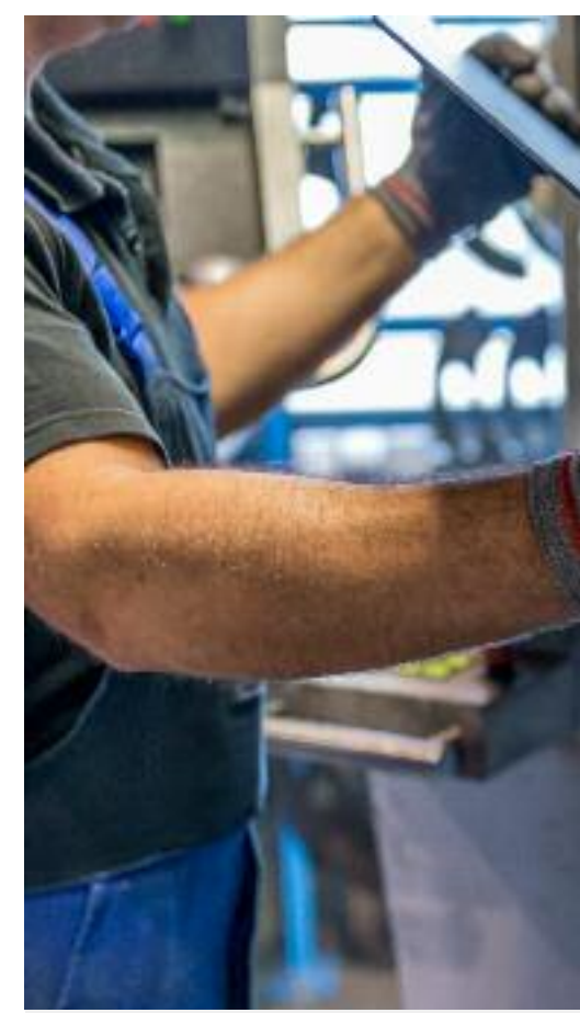
The government's Industrial Strategy is full of init

He went on: "So this Industrial Strategy deliberately strengthens the five foundations of productivity: ideas, people, infrastructure, business environment and places."