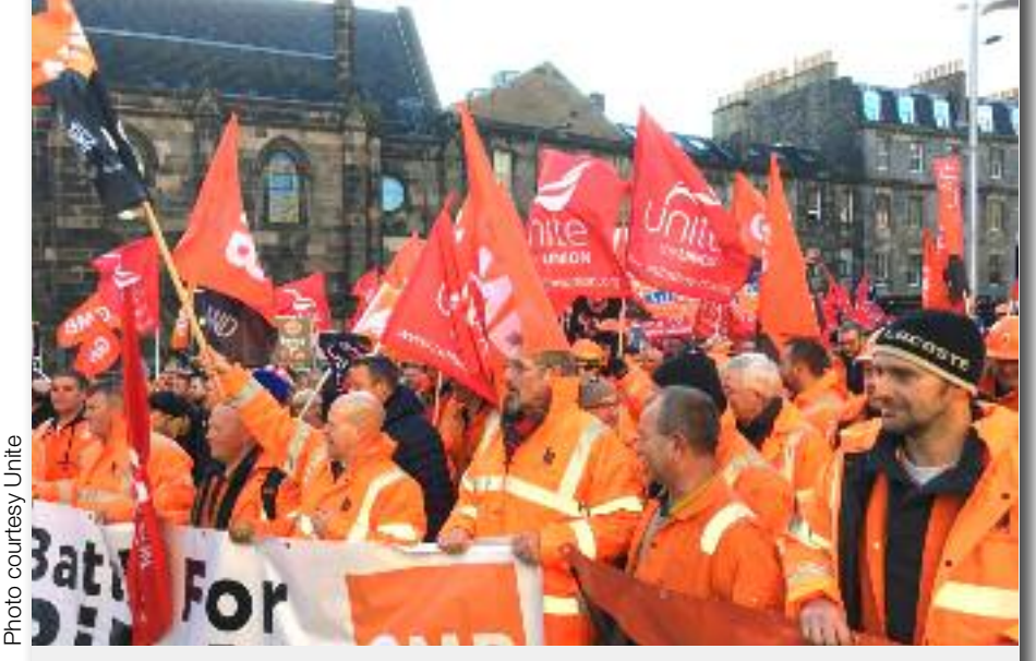
BiFab workers marching in Edinburgh on 16 November 2017.

Visit cpbml.org.uk to sign up to your free regular copy of the CPBML's newsletter, delivered to your email inbox.