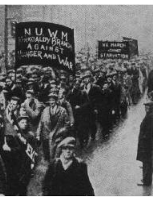
ed Workers Movement.

Attlee's Labour Party government that was to nationalise many industries and services as well as establish the National Health Service.