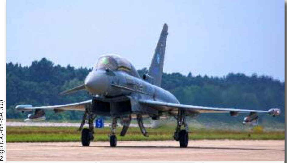
A Eurofighter Typhoon at Germany's Manching airbase in Bavaria.