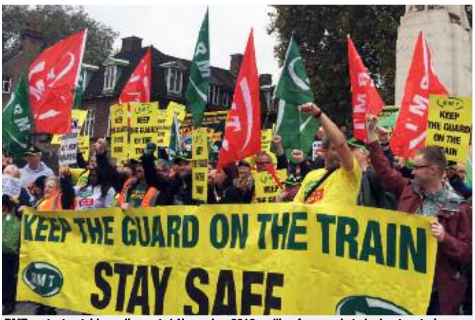
RMT protest outside parliament, 1 November 2016, calling for guards to be kept on trains.

'The RMT needs to consider its tactical options carefully.'