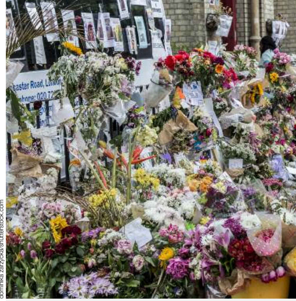
Flowers left by a church near Grenfell Tower, west London, ten days after the deadly fire.

There was once a national body concerned with building control and materials, called the Building Research Establishment (BRE). In 1996 – when the EU was making