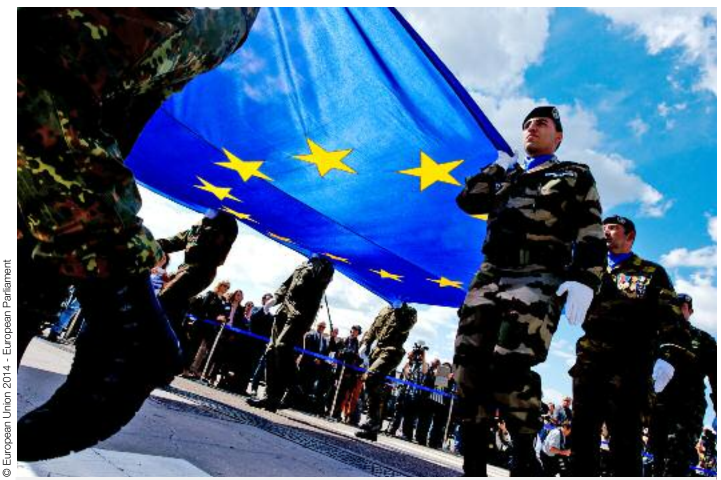
30 June 2014: the Eurocorps parades the EU flag to open the session of the European Parliament in Strasbourg. The Eurocorps has been operational since 1995. Currently 11 states are involved, including Turkey. It has been deployed in Bosnia, Kosovo and Afghanistan.

SINCE OUR vote to Leave, the EU establishment has moved rapidly towards setting up an EU army with a single central command, without any national, democratic controls. Given the EU's aggression in the past – look at Kosovo, Ukraine, and the bellicose stance against Russia – this is a dangerous development. It would give the EU, acting as a bloc, a free hand to beat the drums of war where it chooses in the world.