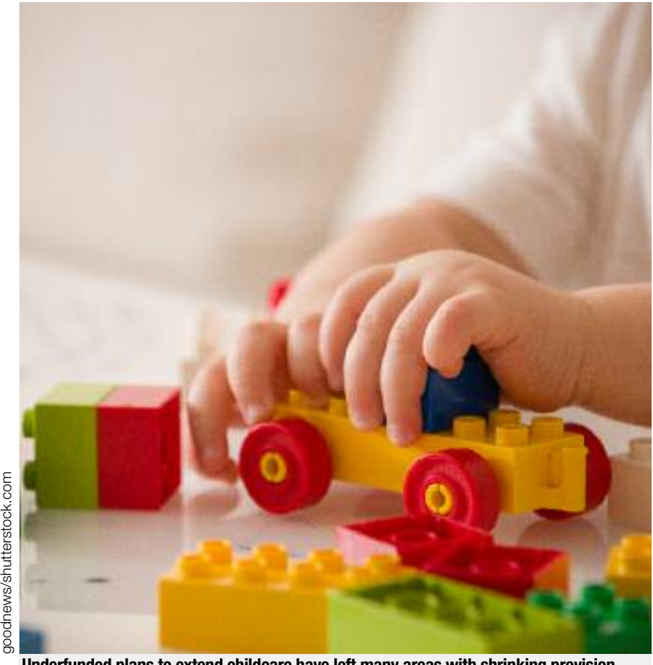
Underfunded plans to extend childcare have left many areas with shrinking provision.

'The number of registered childminders in England has crashed.'