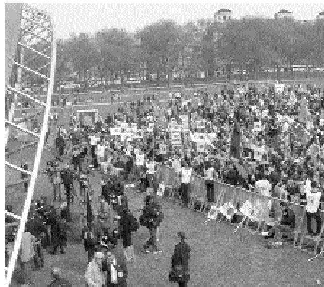
Hyde Park, London, 12 April 2003. The war is over, but we h

"THEY SAID WE would be facing another Vietnam!" scoffed Tony Blair as he tried to attack and discredit those in parliament who had him on the rack over his lies to justify the Anglo-US invasion of Iraq.