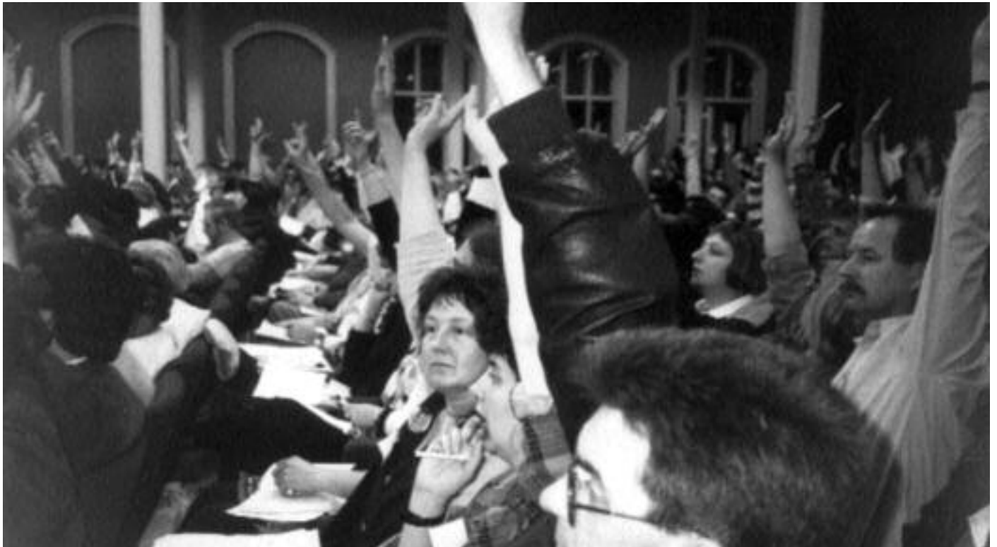
Delegates at NUT Conference — but unity between unions is needed as well as unity within.

THERE IS A CONSPIRACY afoot to maintain and exaggerate the divisions between teacher unions. This is led by the government in pursuit of their 'modernisation agenda', but it is also assisted by those within our unions who seize every opportunity for division and membership war.