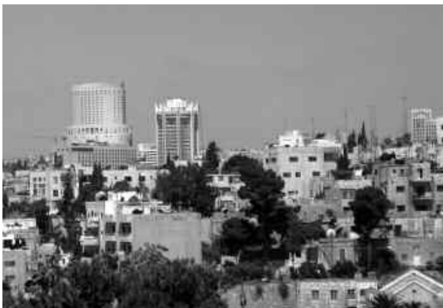
Iraqi billionaires who made their fortune on contracts to build US bases in their country launder their money on building luxury hotels in the safety of Amman, Jordan.

British workers know well of Blair’s legacy in Britain. Fewer know much about his crimes in regard to Israel and Palestine, and the damage he will be doing as envoy. We cannot wish him on anyone else, particularly when he has been so complicit in their ruin. He should quietly go away and leave the people of the Middle East to sort their own future out, just as we must sort out our own in Britain.