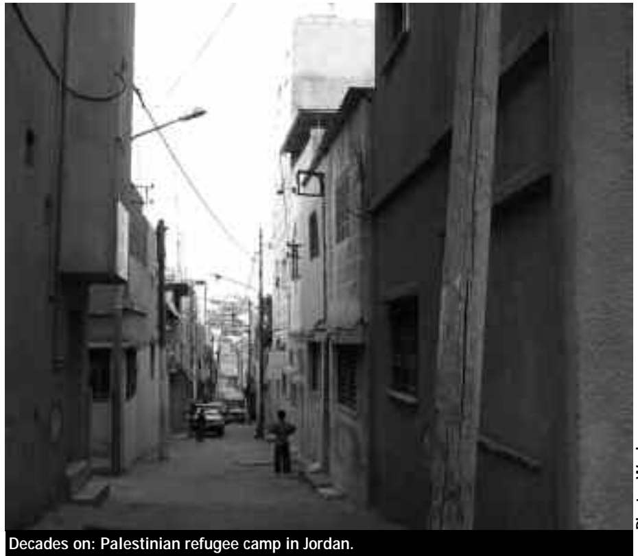
Decades on: Palestinian refugee camp in Jordan.