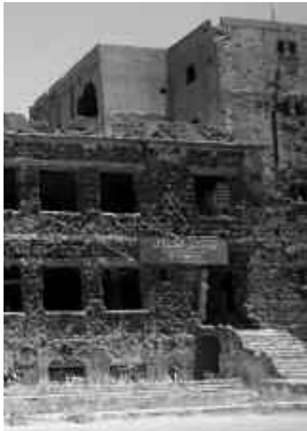
The Golan Hospital, Quneitra: before withdrawing from the Syrian city in 1974, the Israeli army used the hospital for target practice.

Even the new Iraqi bourgeoisie, billionaires from US contracts in Iraq, choose to live in the safer haven of Amman and launder their billions in ostentatious hotels and building projects. They are joined in buying up most of Amman's real estate by the son of the assassinated former Lebanese Prime Minister Hariri, who himself bought up most of Beirut. This is the capitalism that the US/UK wants to build in Iraq, Syria,