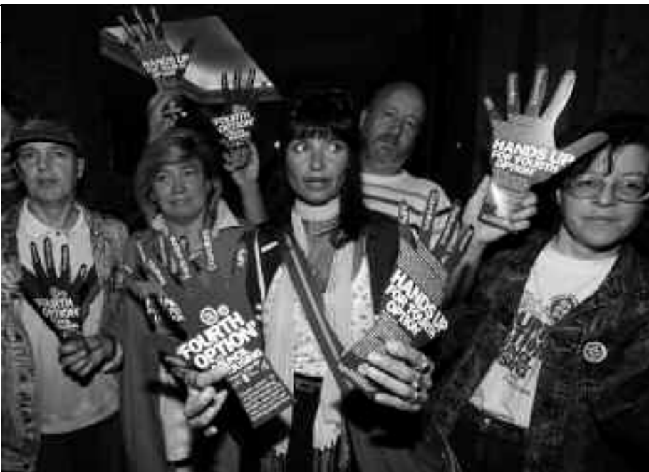
Housing protest: Camden Council tenants and residents demonstrate outside the council chamber on 18 June demanding the "fourth option" after the council refused to hear a deputation protesting against its latest plans for privatising council housing .

The EU is investigating Commission employees alleged to have provided false contracts worth £30 million over four years for cleaning services never carried out. The allegations follow recent arrests, including a Commission official, in a case of suspected corruption involving building contract tenders.