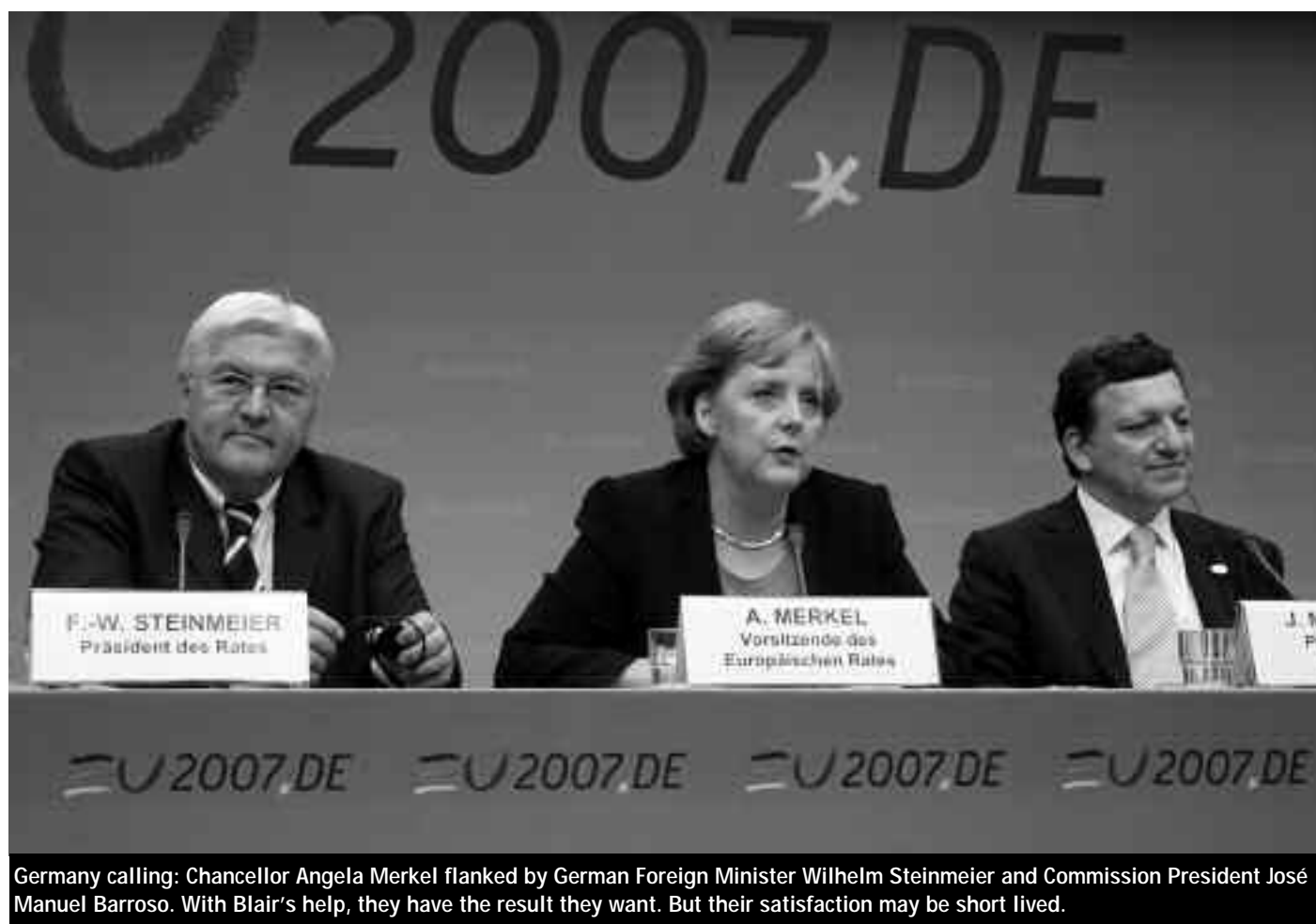
Germany calling: Chancellor Angela Merkel flanked by German Foreign Minister Wilhelm Steinmeier and Commission President José Manuel Barroso. With Blair's help, they have the result they want. But their satisfaction may be short lived.

before : so we want a referendum, as before