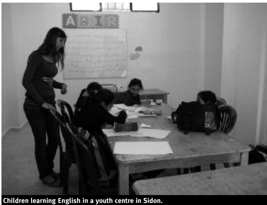
Children learning English in a youth centre in Sidon.

Most Palestinian refugees outside Israel and the Occupied Territories live in Jordan (2,000,000 Palestinian refugees, of whom 20 per cent do not have Jordanian citizenship and live in camps), Syria (250,000 registered without citizenship) and Lebanon (250,000 registered without citizenship). When the internally displaced refugees in the West Bank, Gaza and