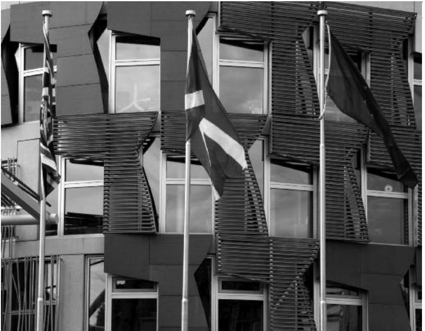
The Scottish Parliament in Edinburgh – with three flags flying outside: the Union flag, the Saltire...and the flag of the European Union! What price Scottish independence?

The political parties have embraced a report that is proposing a far more radical transfer of powers from Westminster to Holyrood than they envisaged when they agreed to set up this commission following the Scottish National Party victory in the 2007 elections – and their unanimity will ensure a smooth and speedy path to the statute books.