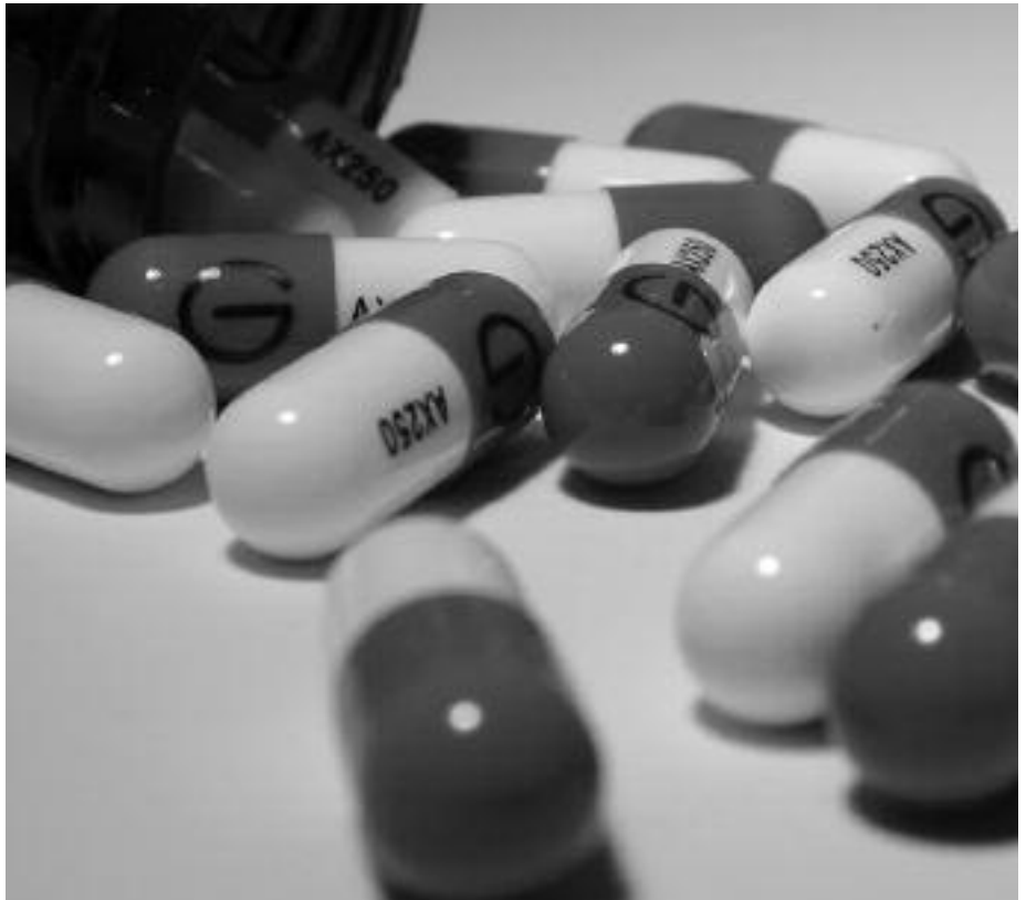
Drug wholesalers are warning Britain could become "the new Greece"

It is said that these "parallel traders"