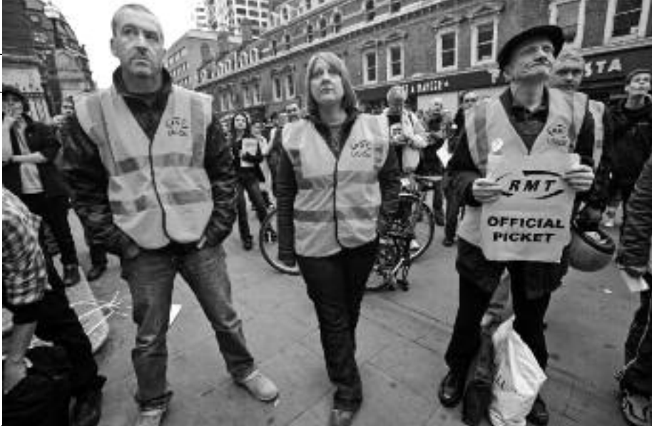
Pickers attending a strike meeting at Liverpool Station, London, at the start of the 48-hour strike on the London Underground by RMT members in defence of jobs and pay.

EU ECONOMIC Commissioner Joaquin Almunia has insisted that Latvia must implement and sustain budget cuts over the long term to get further loans from the EU and the IMF and avoid national default. The cuts include 20 per cent in all public sector workers' pay, 10 per cent in pensions and a 70 per cent cut in the future pensions of those still in work.