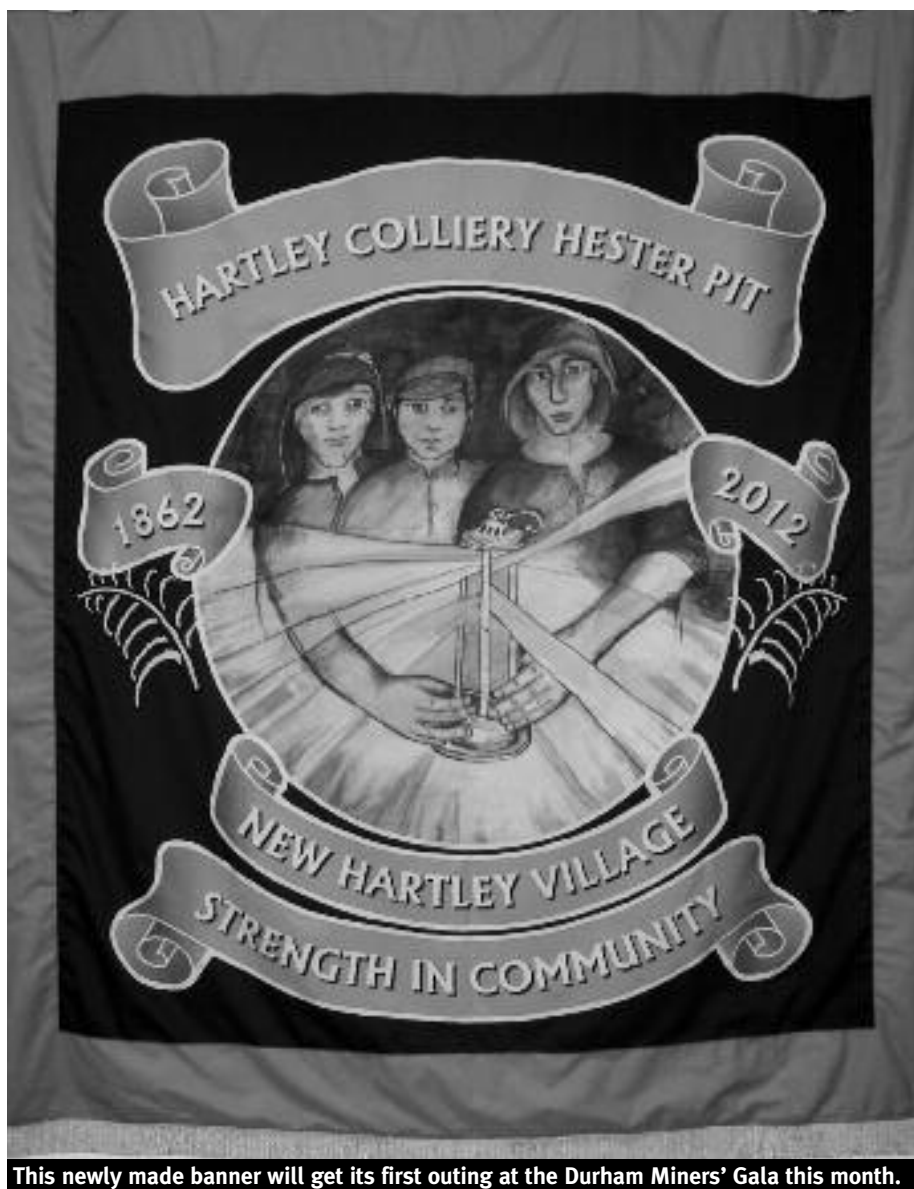
This newly made banner will get its first outing at the Durham Miners' Gala this month.

The 150th anniversary of the Calamity has been marked by the community in a variety of ways. An evening of music and songs was held in the Memorial Hall and there was a dedicated church service at which "The Hartley Calamity" – a ballad