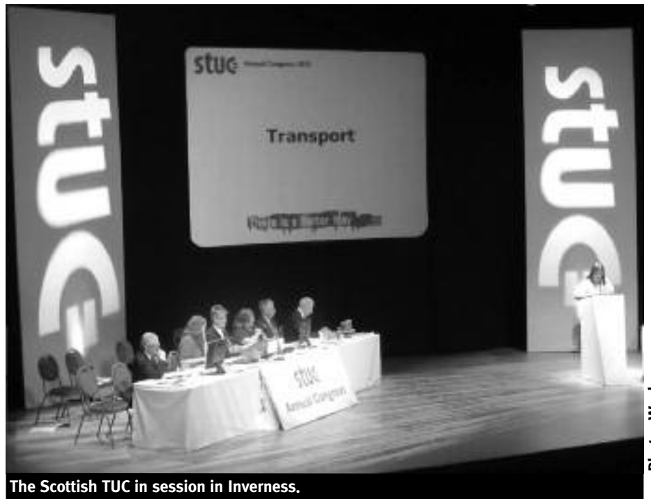
The Scottish TUC in session in Inverness.

A low point was the foolish invitation to First Minister Alex Salmond to address conference. Giving the unions praise and