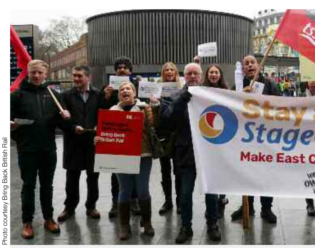
10 April 2018, King's Cross, London: campaign group Bring Back British Rail call for a public Ea

The East Coast Main Line franchise seems in particular to be a poisoned chalice. The two previous private operators both had to hand back the keys after defaulting on their commitment to pay the government out of profits made from the franchise. After a profitable spell under public ownership, the