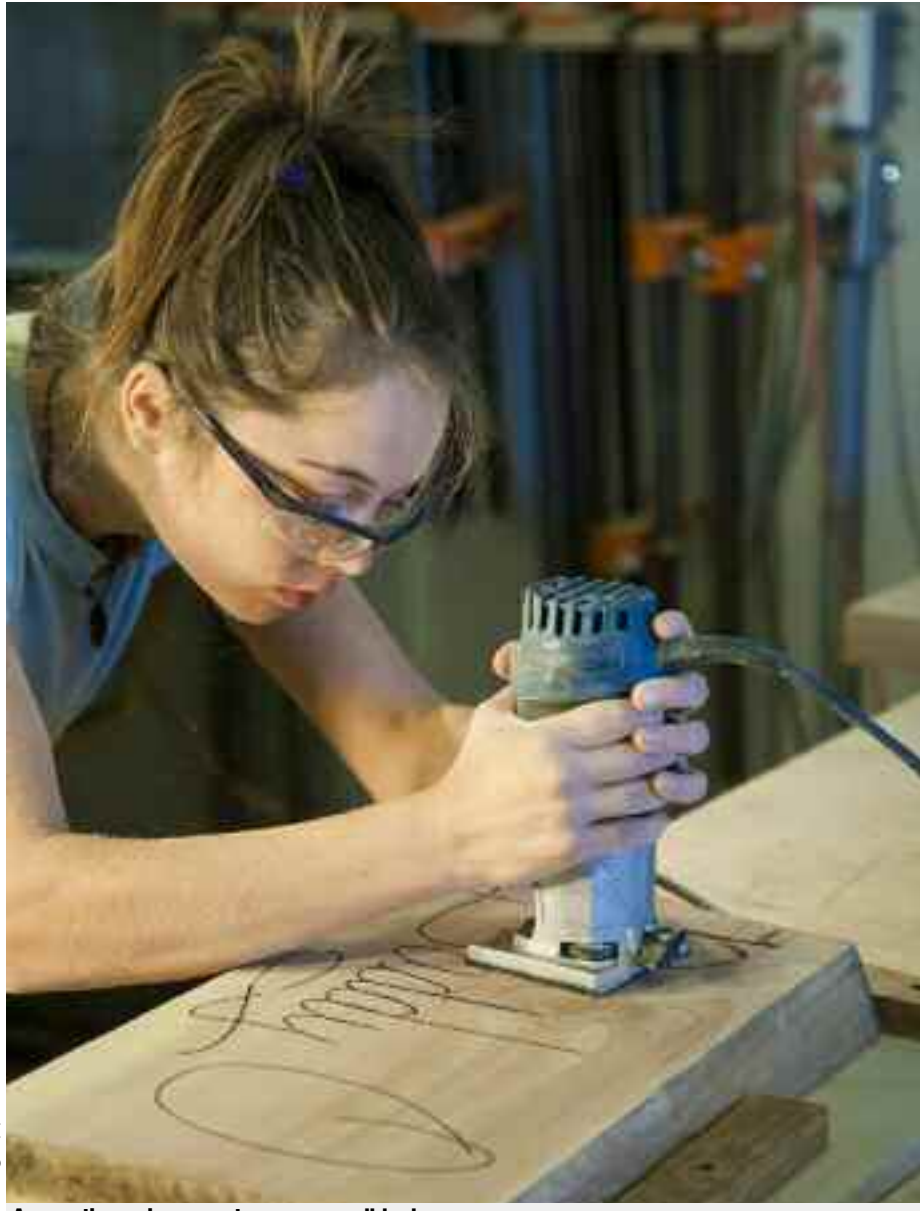
Apprentice using a router on a woodblock.

FAR TOO many employers avoid training by importing workers from elsewhere. In fact, the TUC estimates that a third of British employers make no investment in training whatsoever. This is not sustainable inside or outside the EU, but outside there is an opportunity to make a change.