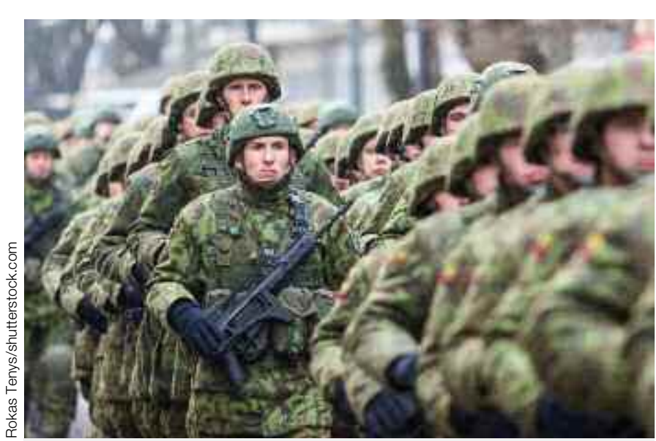
NATO exercise in Kaunas, Lithuania, February 2017.

This would require us to pay large sums to the EU and to obey Single Market rules in