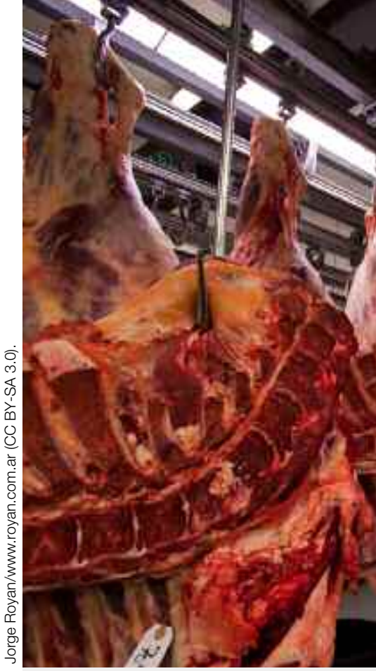
Beef carcasses in Smithfield Market, London.

In recent years the reduction in funding