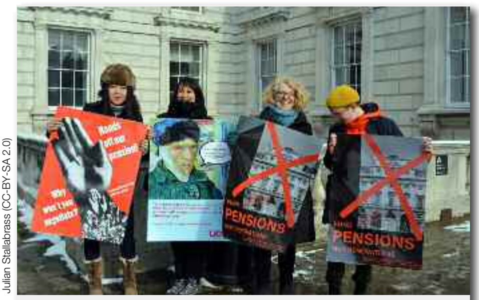
UCU members at the Courtauld Institute, London, putting their point over while on strike, 28 February.

Visit cpbml.org.uk to sign up to your free regular copy of the CPBML's electronic newsletter, delivered to your email inbox.