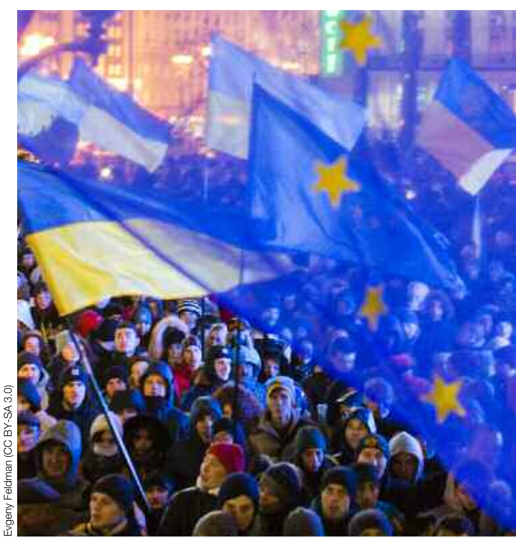
An EU-backed demonstration in Maidan Nezalezhnosti, Kiev's main square. The protests turned in

This article is an edited version of a speech delivered at a CPBML public meeting in London on 20 February.