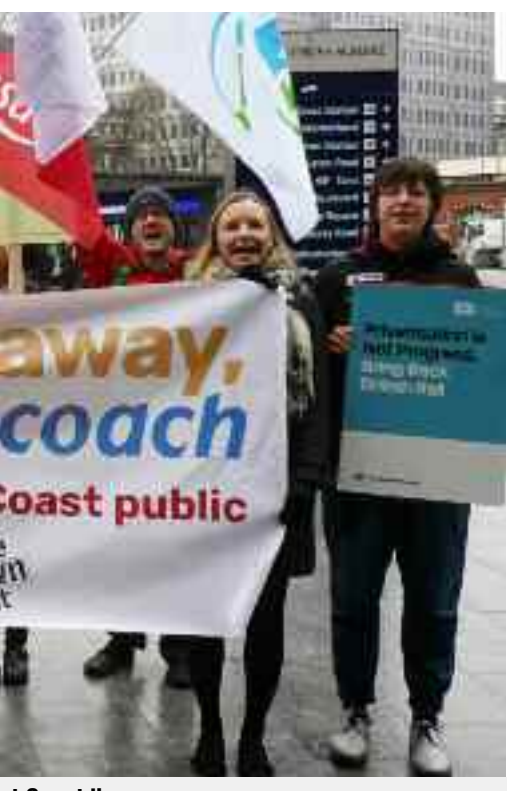
st Coast line.

pill of handing the East Coast Main Line back to the public sector to run.