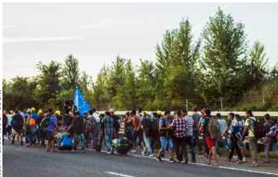
Refugees on the Hungarian M1 highway on their march towards the Austrian border, 4 September 2015.

Populism and the European Culture wars: The Conflict of values between Hungary and the EU, by Frank Furedi, paperback, 144 pages, ISBN 978-1138097438, Routledge, 2017, £14.99, Kindle and eBook editions available.