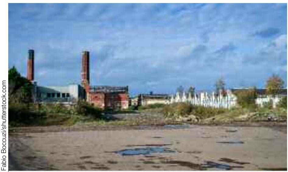
Abandoned factory buildings, Edinburgh.

Venture Capital Association "invested" £4.3 billion in the UK, almost all buying existing assets. Only £0.3 billion was venture capital.