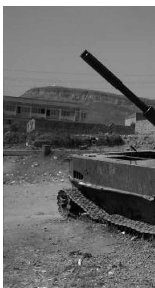
Relic of the struggle for independence: burnt-out

After 1900, European colonial governments began to introduce changes to colonial rule to increase revenues. These changes included taking land from Africans and giving it to European settlers. They also introduced taxes such as the hut tax and poll tax that forced the