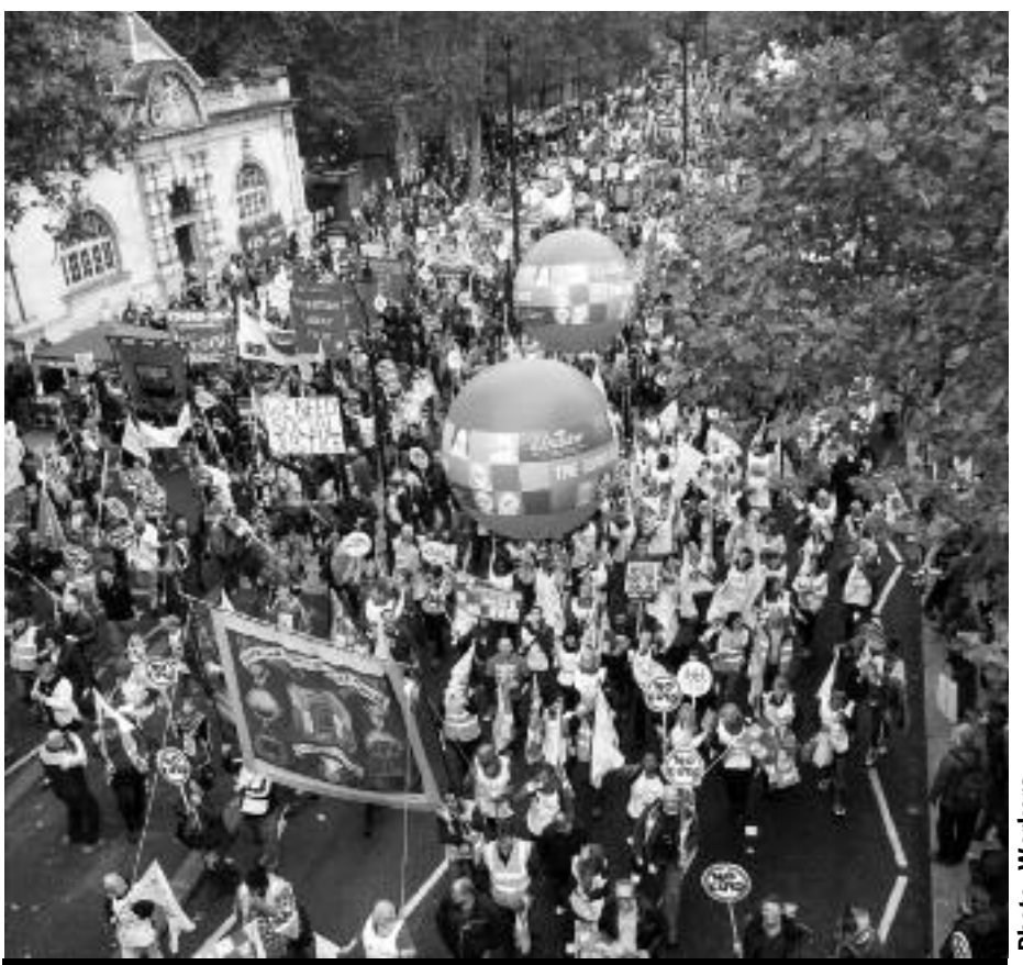
TUC march, 20 October 2012: without a fight for wages and conditions, attempts to retain public sector provision will not succeed.

Do we hope that state provision of something takes that aspect of our lives out of the grip of capitalists? Or if we work for the state do we hope, against all evidence, that the employer will be kinder? Yet many of the successes of our class and positive features of Britain have become part of the state. That hasn't been wrong or something to criticise. The fears of life without proper healthcare or of ignorance and low self