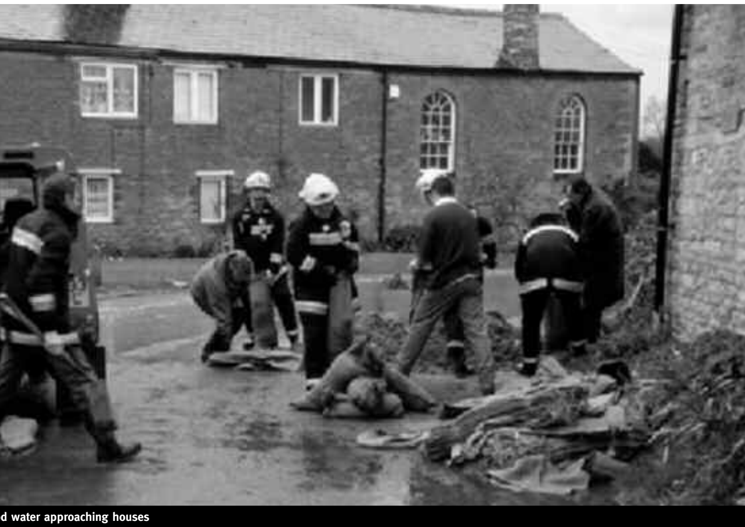
and water approaching houses