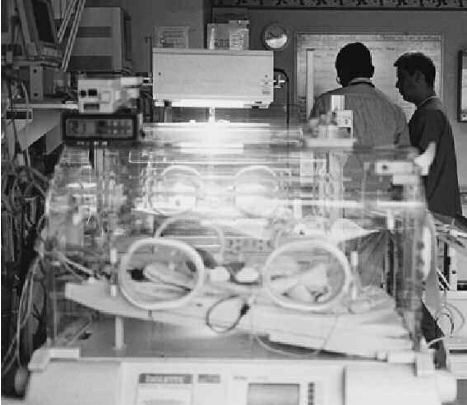
Neonatal intensive care: the NHS needs more intensive care beds, but the private sector in general cannot provide them.

The private hospitals will not run with excess capacity for any length of time as that affects profits. Any additional capacity that it can switch on has to be staffed and where will the staff come from? From the over-stretched NHS, where else!