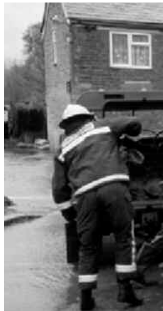
Firefighters filling sandbags in readiness for floods

THE BRITISH, it is often said, like nothing better than talking about the weather. Well, recent events must have sent the talking into overdrive. But the good thing is that there has been a fair bit of thinking too. Floods of it, in fact.