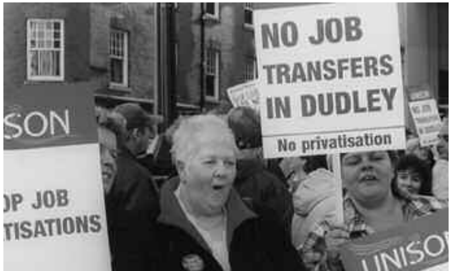
Striking hospital workers take to the streets in Dudley, West Midlands

• A longer version of this article is available on www.workers.org.uk