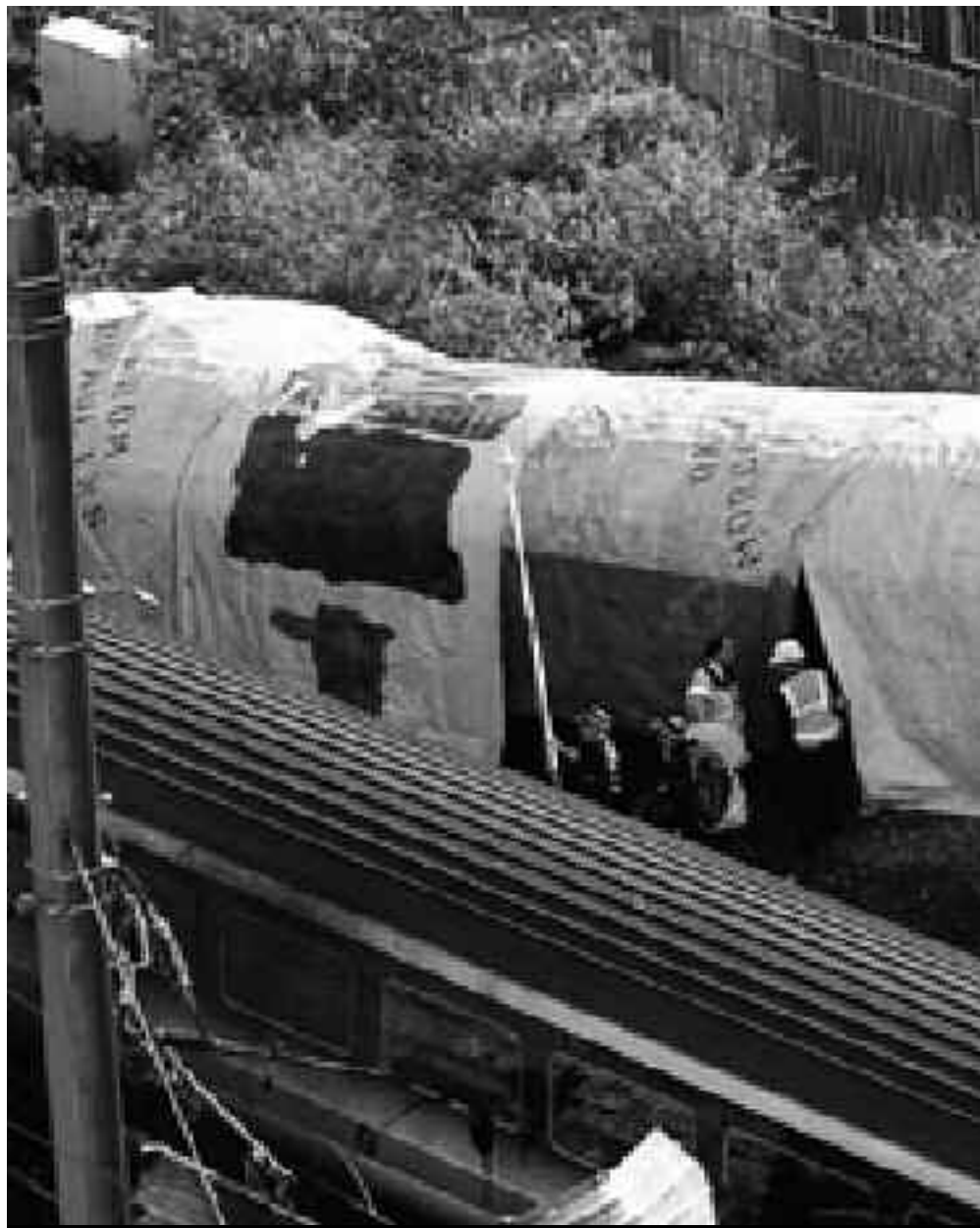
The mangled wreckage of coach H, Ladbroke Grove, last year. They said it should never happen

The recent crash at Bristol involving a mail train whose brakes failed is another