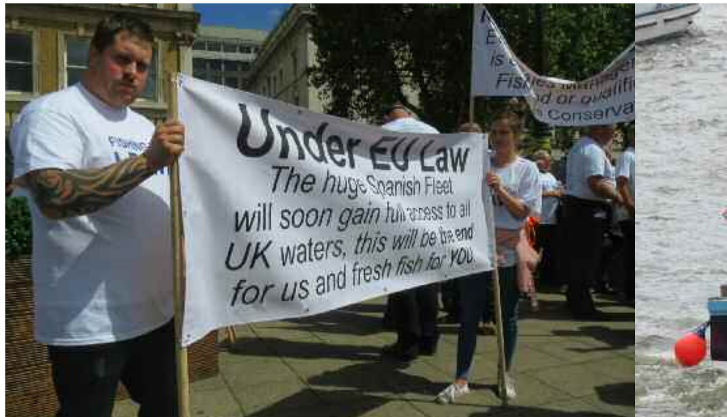
Kent fishermen and their families demonstrating near old Billingsgate, London, in support of their Leave flotilla on 15 June. Right: one of the boats allow

AN ISLAND surrounded by sea, at a latitude and with sea conditions that offer optimal conditions for the reproduction and management of fish should have a thriving fishing industry, able to feed its own people and to trade with the rest of the world.