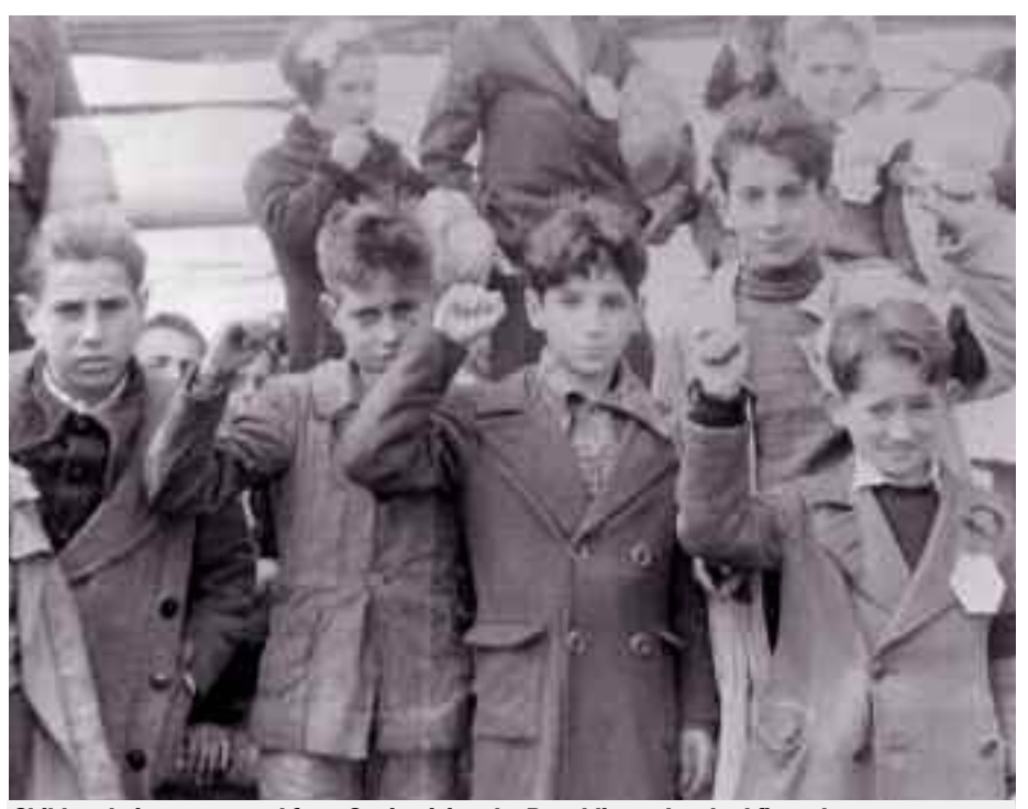
Children being evacuated from Spain giving the Republican clenched fist salute.

'The Soviet Union alone armed and backed the Spanish Republic.'