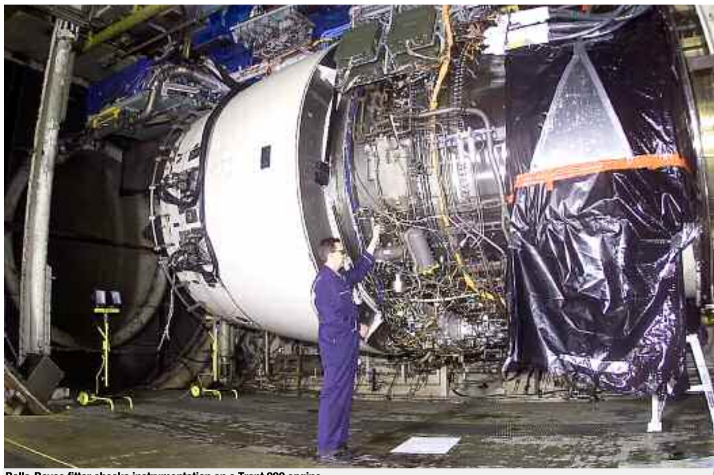
Rolls-Royce fitter checks instrumentation on a Trent 900 engine.

ENGINEERING AND manufacturing even in their current state are important to Britain and are likely to become more so as we import less and export more following the referendum decision. Producing useful items creates value for our nation and items we can trade with the rest of the world.