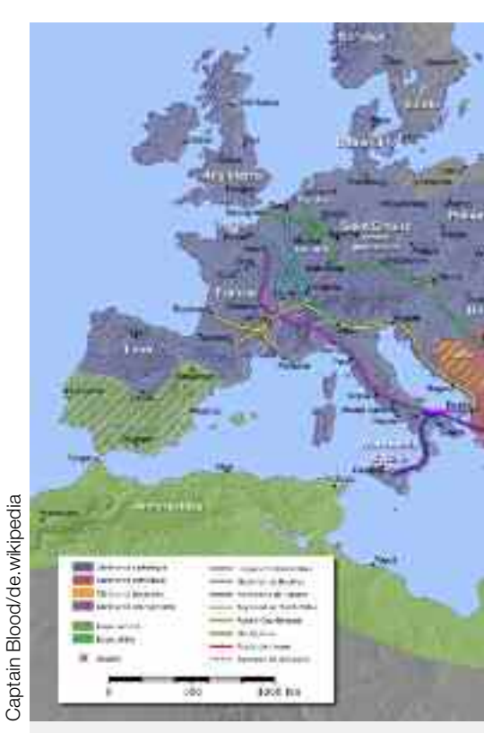
A map – in French – of the First Crusade.

The Ninth Crusade, 1365-66, was launched against Egypt, which had been at peace for the previous fifty years. It ended in the holocaust of Alexandria.