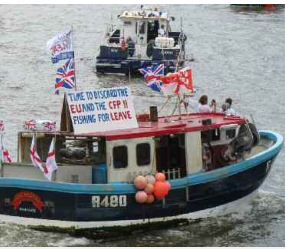
ed upstream to demonstrate outside Parliament.

House of Lords then ruled that British legislation was subordinate to EU law.