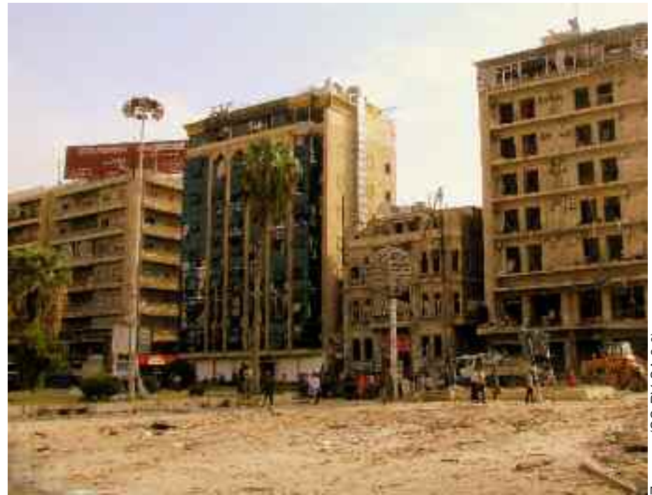
The scene of the October 2012 Aleppo bombings: al-Nusra Front claimed responsibility.

Syria and Iran are the only countries in