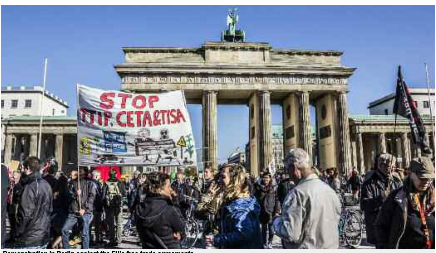
Demonstration in Berlin against the EU's free trade agreements.

THE REFERENDUM campaign saw the development of a malicious myth. That myth sought to give the impression that TTIP – the Transatlantic Trade and Investment Partnership – is on its last legs. Or at least that if the treaty as a whole is not doomed, then the contentious parts of it are.