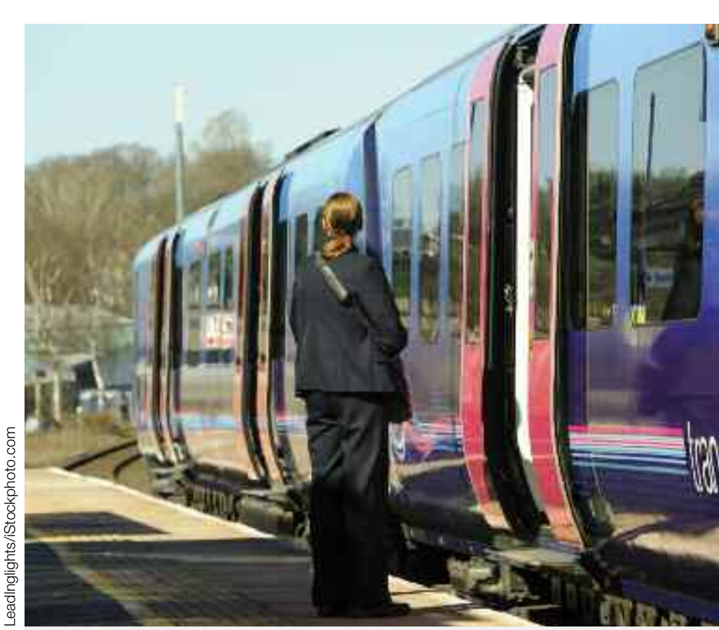
Endangered species? Guard at Kendal station waiting for the all clear to safely dispatch a passenger

'GTR has tried to turn the public against guards and their union.'