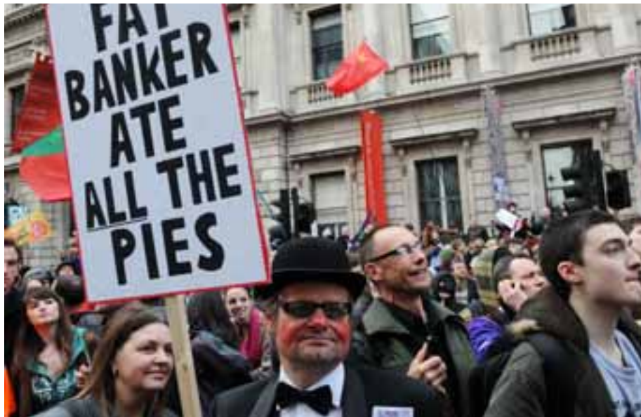
A clear message from the TUC anti-austerity rally in London, March 2011.

The value of everything: making and taking in the world economy , by Mariana Mazzucato, hardback, 358 pages, ISBN 978-0241188811, Allen Lane, 2018, £20. Paperback, Kindle and eBook editions available.