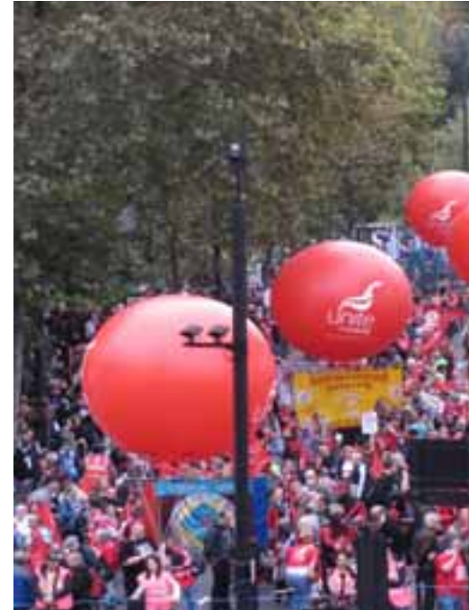
Balloons and razzmatazz...all the essentials of the membership numbers, membership density and in

We should ask in every union "how strong are we in our localities and work-