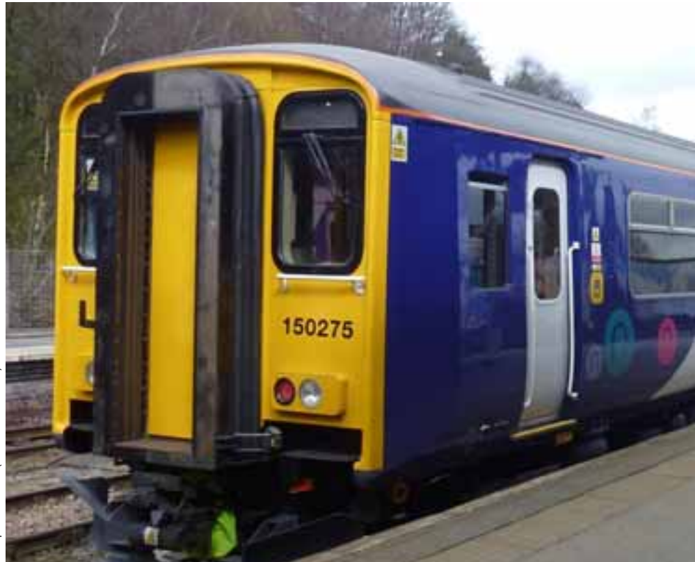
Rcsprinter123 (CC-BY-SA 3.0)

In London, the Thameslink route is at the centre of the problems. A project initially called Thameslink 2000 has finally been