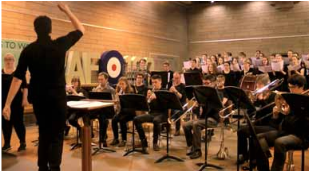
The University of Glasgow Chapel Choir perform Schulhoff's Communist Manifesto .

choir (sopranos, altos, tenors and basses) with 4 solo singers – and re-arranged the orchestra to consist of 13 brass players, a pianist and several percussionists. Selected singers perform the children's choir role from Schulhoff's original score.