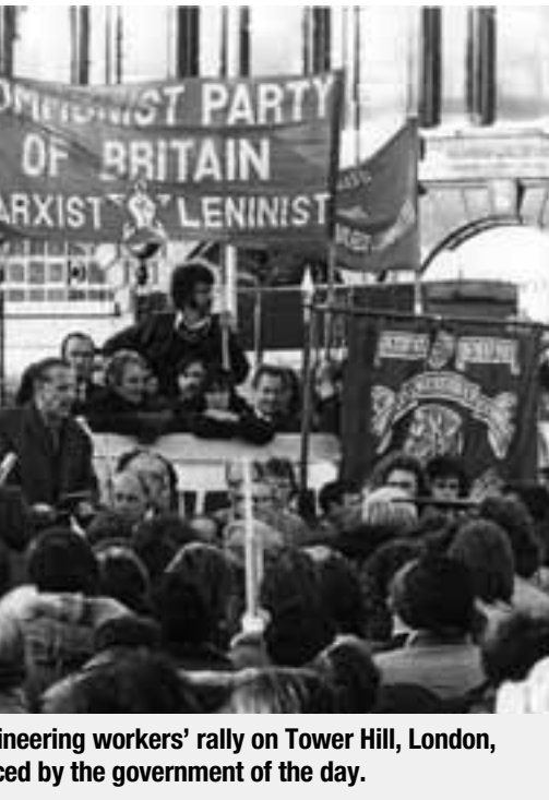
Engineering workers' rally on Tower Hill, London, organised by the government of the day.

association, where everyone is expected to take responsibility and play a full part in developing the thinking and activity of the Party, solely for the purpose of enhancing the effectiveness and power of the working class. We operate on the willing and equal commitment of members.