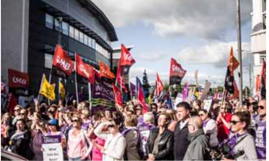
Pickets outside the HQ of East Dunbartonshire Leisure &amp; Culture Trust in Kirkintilloch.