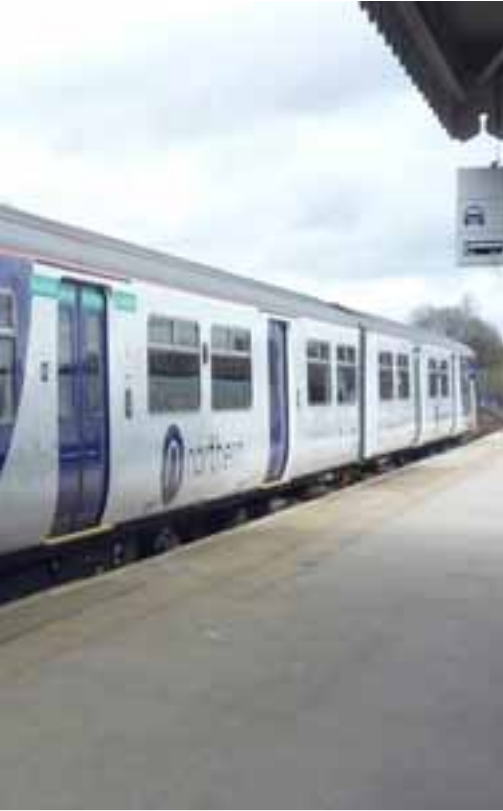
0 trains a day when the new timetable came in.

existing diesel trains have continued to run, causing a shortage of trains elsewhere. This was exacerbated by the long-running dispute between Arriva Northern and the RMT over the government's pig-headed decision to reduce costs by undermining safety and encouraging Arriva Northern to remove guards in the teeth of opposition from the union and passengers alike. A delay in reaching an agreement with drivers' union Aslef over working rest days added to the mix, delaying driver training for new routes.