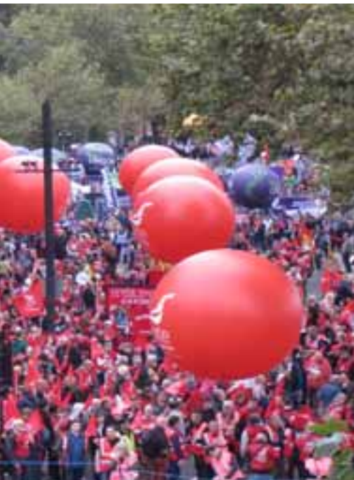
e modern “super-union” – yet for all their vast involvement are often low.

leaders and politicians who have effectively been allowed to assume control in many unions in the absence of an authentic mass of workers wanting to direct matters. Taking back active control of proceedings is essential for British workers. This would transform the influence of trade unionism, which is increasingly ignored.