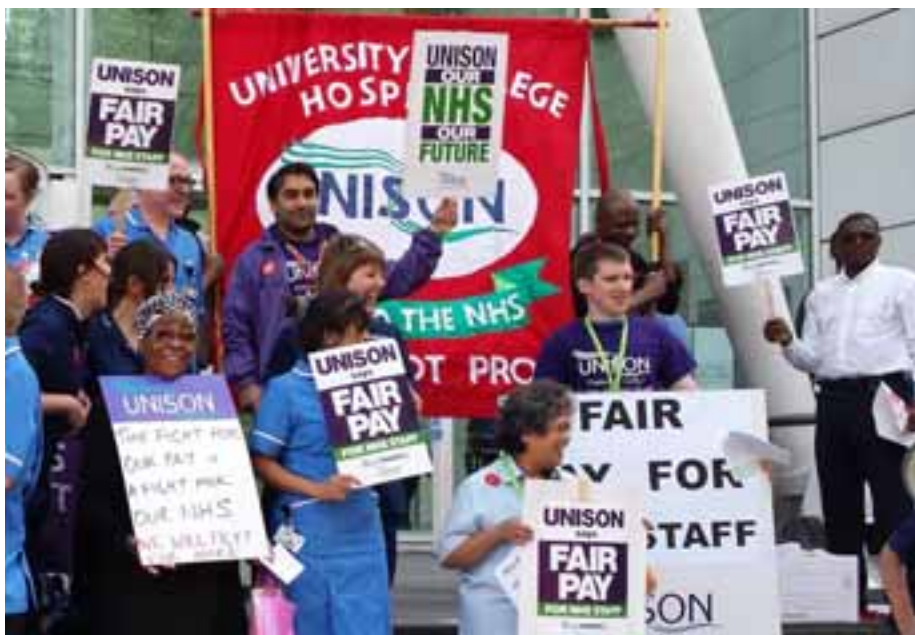
Workers picketing at UCH Hospital, London, during the pay dispute in 2014.

MEMBERS OF UNISON, the largest union in the NHS, have voted overwhelmingly to accept the latest pay agreement with the employers in England. Overall, 13 out of the 14 bargaining unions have said yes.