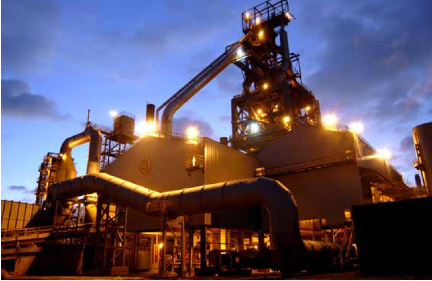
Blast Furnace Number 5 at Port Talbot, South Wales.

lished the “Greensteel” strategy. This aims to drastically slash the amount of raw material imported into Britain. To make that a reality, it proposes to dramatically increase our capacity to re-cycle scrap using electric arc technology powered by renewable energy.