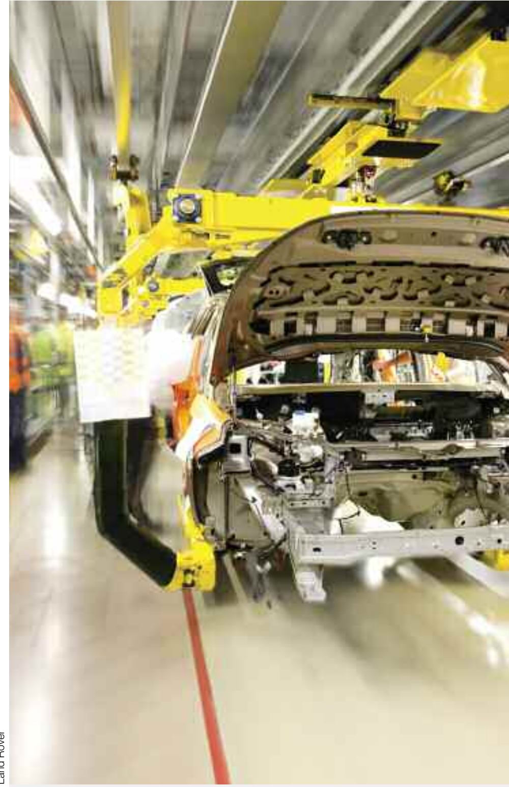
The Land Rover assembly line in Halewood, Merseyside, with the first Discovery Sport on its wa