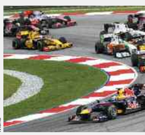
Formula 1, the opening lap of the 2010 Malaysia employment servicing Formula 1 has been creat

The Red Bull factory and headquarters in Milton Keynes.