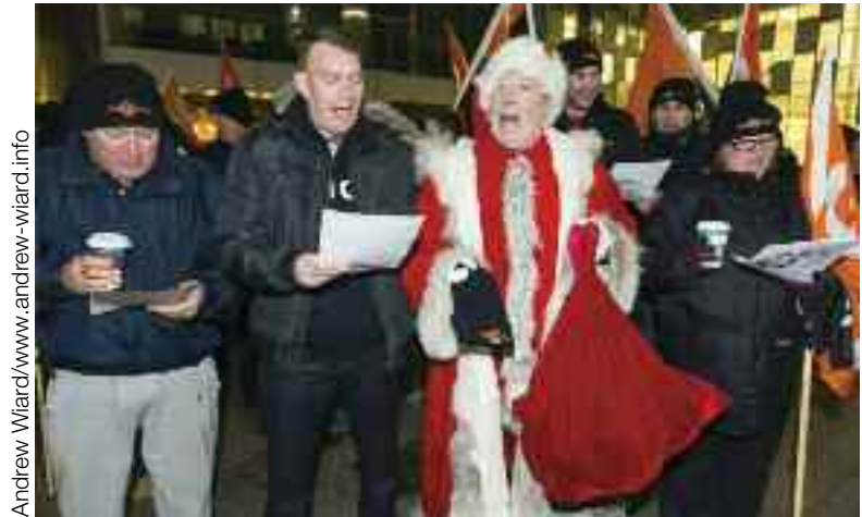
GMB members held a "Santa demo" at Barking and Dagenham's cabinet meeting before Christmas as part of their fight. Santa is giving out GMB beanie hats, which GMB members had been told not to wear.

Unite and Unison members also wanted to challenge the proposals but chose to take a different approach. Unison registered a dispute with a view to going into talks.