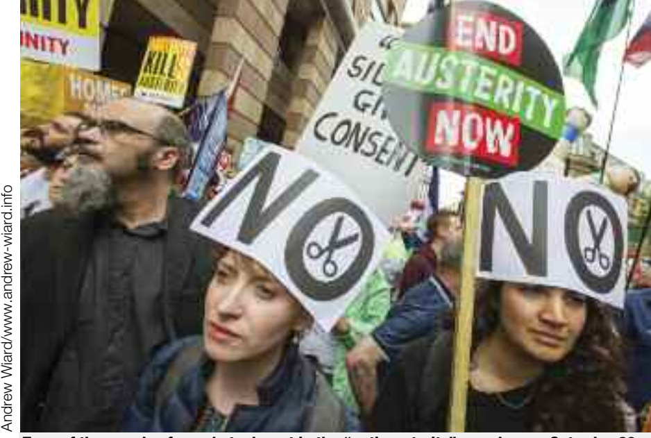
Tens of thousands of people took part in the "anti-austerity" marches on Saturday 20 June. Photo shows marchers in London.

Visit cpbml.org.uk to sign up to your free regular copy of the CPBML's newsletter delivered to your email inbox.