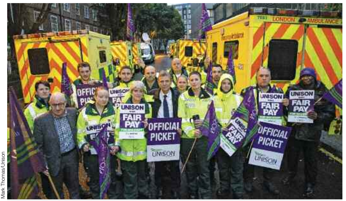
Leading by example: London ambulance workers picketing during the health pay dispute in October 2014. Where members are involved, the fight for pay can be a spur to unity.

To be effective unions must exert an influence in the workplace, where each collective should seek an impact over working arrangements. Combine. Enforce your common interests. Exert a work discipline. Because organised workers who press their case get respect and make an impact.