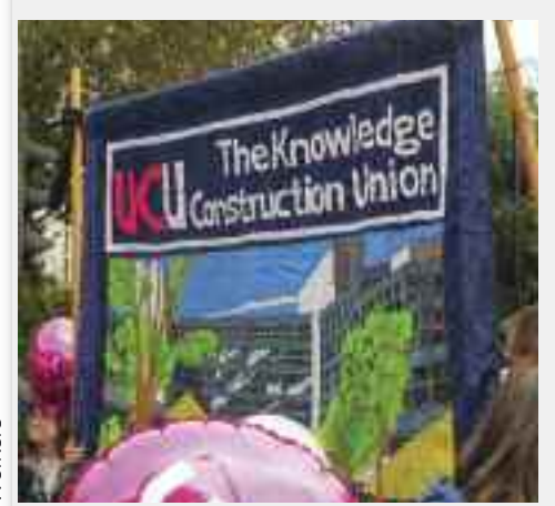
UCU banner on the TUC's "Britain Needs A Pay Rise" march in October 2014.

Branches across Britain will need to consider carefully the next steps on pay and in particular what type of action would be most effective. What aspects of the employers' core business can most easily (for us) be interfered with by selective action short of a strike? Conducted alongside public and unifying strike action, such tactics can be highly effective.