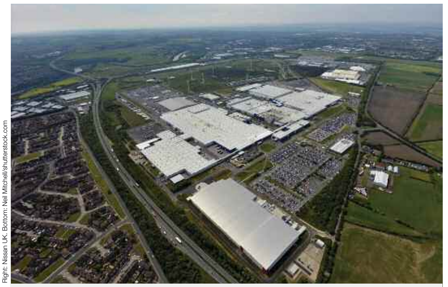
Nissan's Sunderland plant, built on the site of a former RAF airfield – last year its production of 500,000 cars, mostly Qashqais, outstripped car output of the whole of Italy. Below, MG3 super-minis awaiting transport at Longbridge, Birmingham.

THE BRITISH MOTOR industry is bucking the trend of decline – even though there are no longer any major British-owned motor manufacturers. It is an industry that thrives outside of the EU and demonstrably would thrive even more without the EU's destructive restrictions.