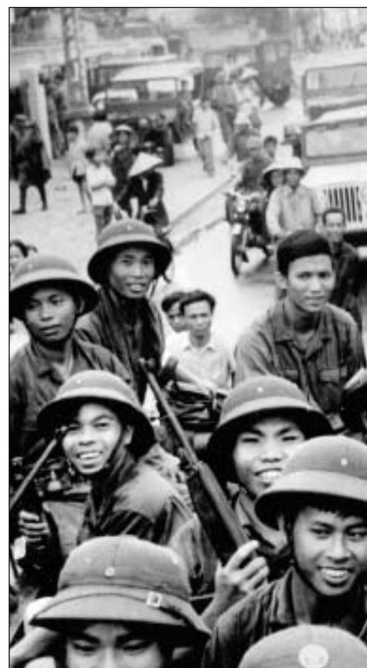
Three years later: victory as the South Vietnam Libe

The various 'Left' factions in the social democratic circus have acted entirely true to form. The 'Left wing' of the Labour Party and the King Street revisionists, never daring to support the Vietnamese, made little deprecating noises about the bombing of north Vietnam. (The burning alive and bloody murder of people throughout the country was all right – just stop bombing the north). The Trotskyists were happy to support the Vietnamese as long as they were convinced the