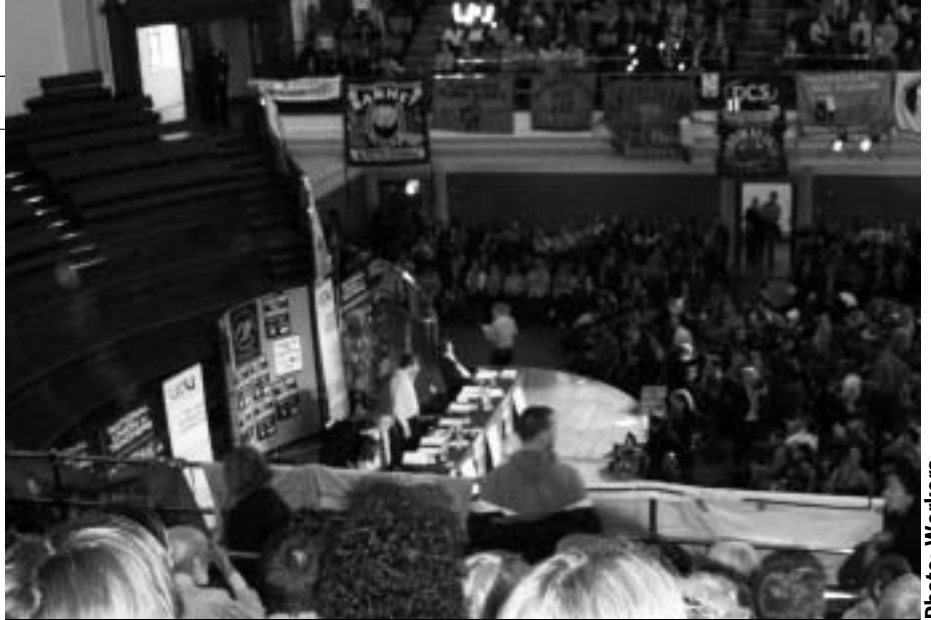
Teachers from schools and colleges pack Central Hall, Westminster, for a rally during the one day strikes by the NUT and UCU last month.

Commissioner Boel "completely discards" the idea that biofuels are behind the increase: "The most important factor is the climate", she said.