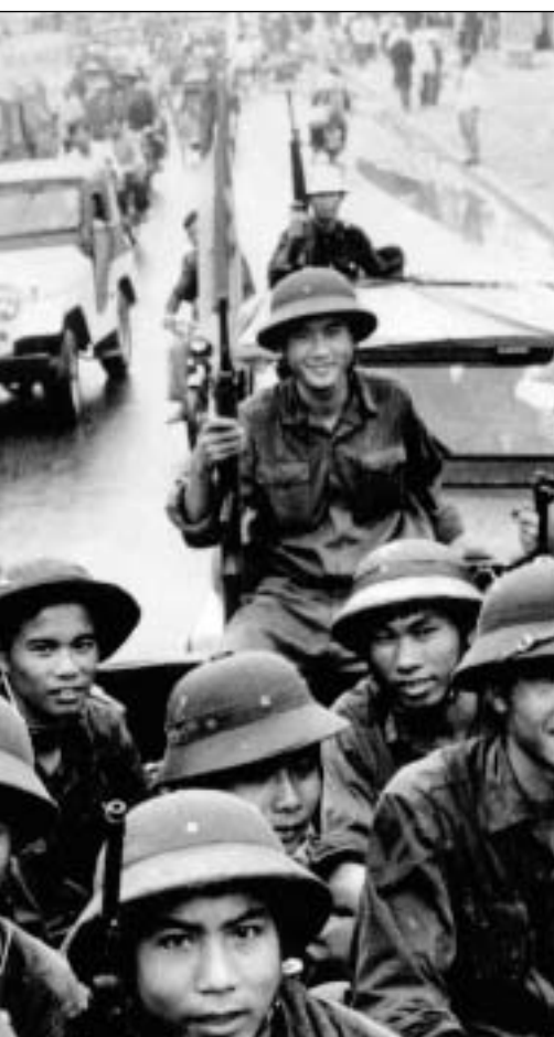
Operation Army enters Da Nang City on 29 March 1975

duty? Why have we left it to the Vietnamese people, in the way an earlier generation left it to the Soviet working class, to carry the burden of revolutionary war without our taking the action here that would have complemented their struggle? Can we shake off this social democratic sleeping sickness before it numbs us entirely?