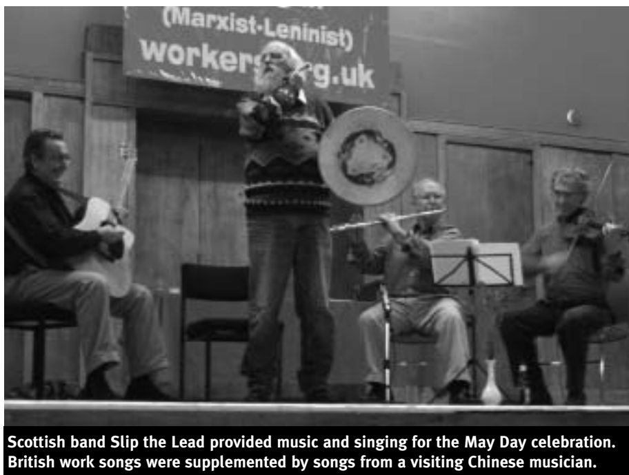
Scottish band Slip the Lead provided music and singing for the May Day celebration. British work songs were supplemented by songs from a visiting Chinese musician.