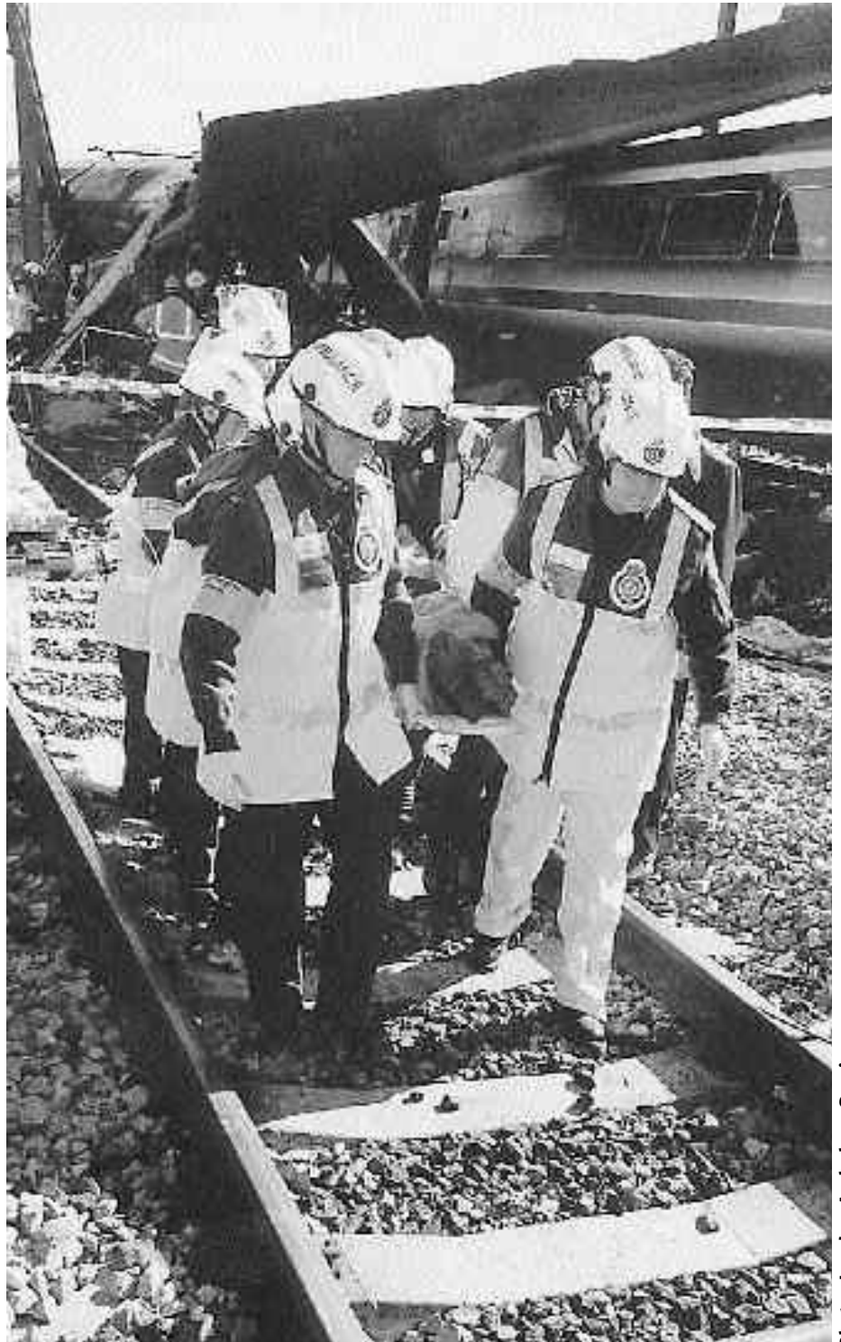
Ambulance workers in action during last year's Paddington train disaster.

This system, which had led to the creation of swollen egos and expense claims, was tackled by the establishment of a single UNISON branch. The union demanded a single-table bargaining structure on which UNISON's pre-