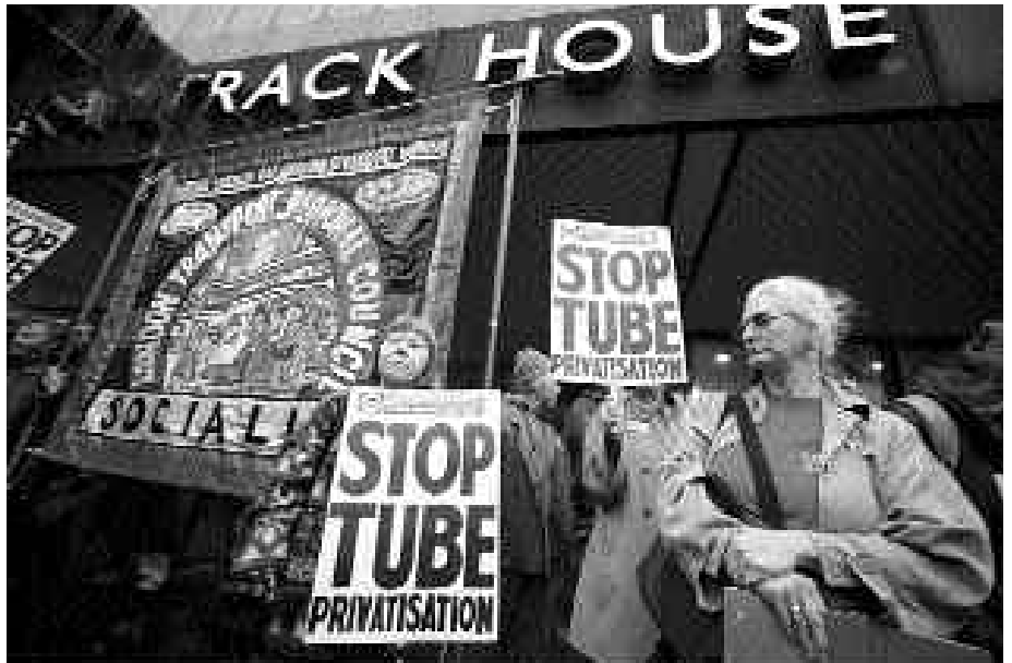
Unsafe: RMT demonstration in London last year outside Railtrack's London HQ against privatisation of the tube and of rail services.