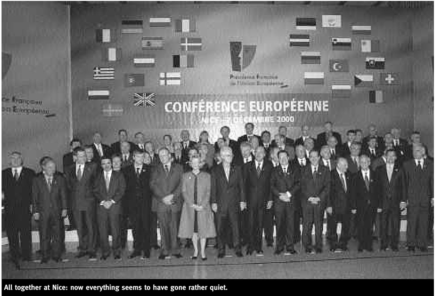
All together at Nice: now everything seems to have gone rather quiet.

AT ONE TIME, the euro was always in the news. Columnists debated whether it would end sovereignty; economists argued about whether it would work. Now that it has been introduced, it seems to have vanished; even its continuing fall is not newsworthy.