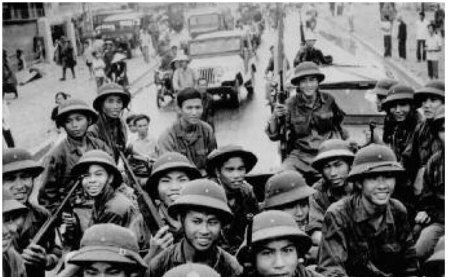
The victorious Vietnamese entering the former US base of Danang in 1975.

The Vietnam Workers Party was formed in 1951. Its programme was to win indepen-