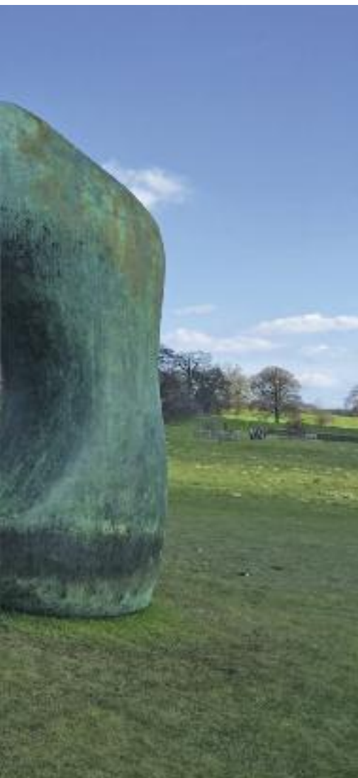
Commissioned by the Arts Council and London County

bubble is growing four times faster than the British workforce as a whole, contributing £77 billion of “value added” [see Workers , March/April issue for meaning of this term]. But, it says, more investment, participation, education and access to digital technology is needed to maximise “value”.