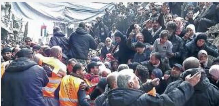
UN workers distributing food in Yarmouk in February 2014.

REPORTS HAVE reached Workers that the combined force of all the armed rival Palestinian factions in the giant Yarmouk refugee camp in Syria, plus the Syrian Arab Army and the Palestinian Liberation Army, a division of the SAA, have liberated most of the camp from ISIS, the terror group. Information is still very sketchy, and the number of casualties is unknown. There is now talk about aid getting into the camp.