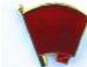
Red Flag badge, £1