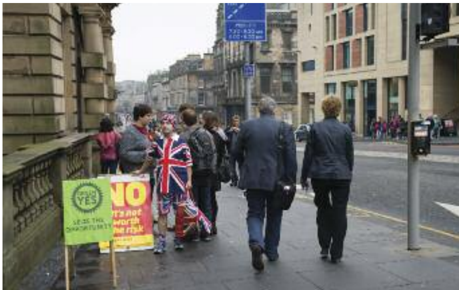
The Scottish referendum: in the end, the vote was decisively against separation.

Just like the Labour Party, Salmond and the SNP oppose a democratic referendum on EU membership. And Salmond endorses the SNP's undemocratic proposal that, if a referendum is held, there should