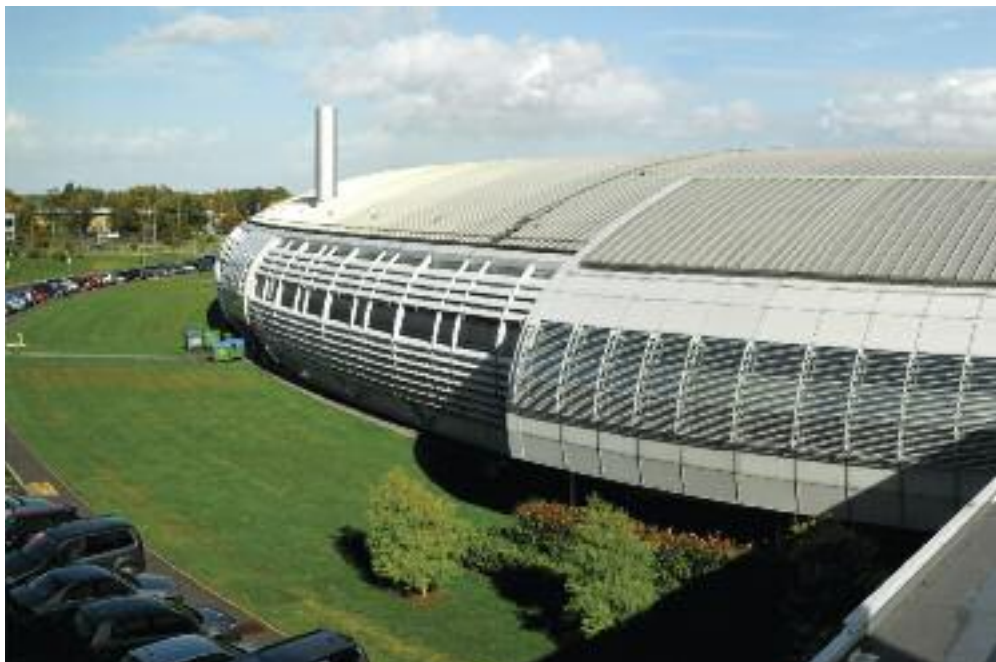
The Diamond Light Source, Britain's (sole) national synchrotron facility, at Harwell, Oxfordshire. It

Private industry is hopeless: the amount it invests in R&D is just 0.57 per cent of our GDP, against 0.85 per cent in Germany and 0.92 per cent in the US. No wonder Paul Nurse, President of the Royal Society, talks