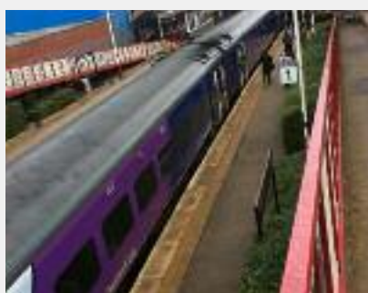
A Northern Rail train at Pudsey station – Northern Rail is part owned by a Dutch state company.

AS PART OF its activity around the General Election, rail union RMT organised a series of protests across the north of England highlighting the fact that hundreds of millions of pounds paid by British rail passengers will be going to subsidise rail services in other parts of Europe.