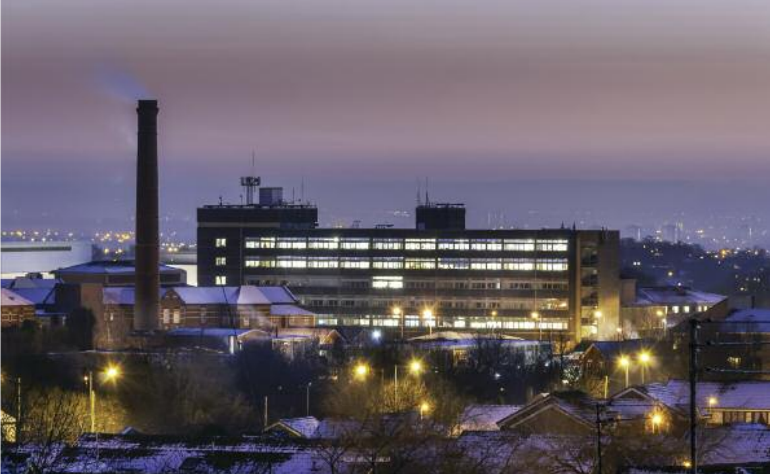
Tameside Hospital, Greater Manchester. DevoManc could see budgetary control go to an authority set up without any democratic mandate.

It has not taken long to see how this drive to localism will manifest itself. On 27 February it was announced that DevoManc is being used to further break up the NHS and to take away everything that makes it a national health service. Greater Manchester began to take control of a local health budget from this April. The region's councils and health groups will take over £6 billion allocated for health and social care, with full devolution planned by April 2016.