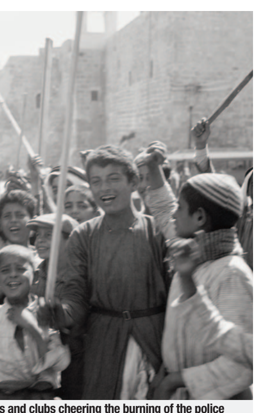
clubs cheering the burning of the police

demanding as the prime condition for peace that Israel withdraw from occupied Arab lands. It never has.