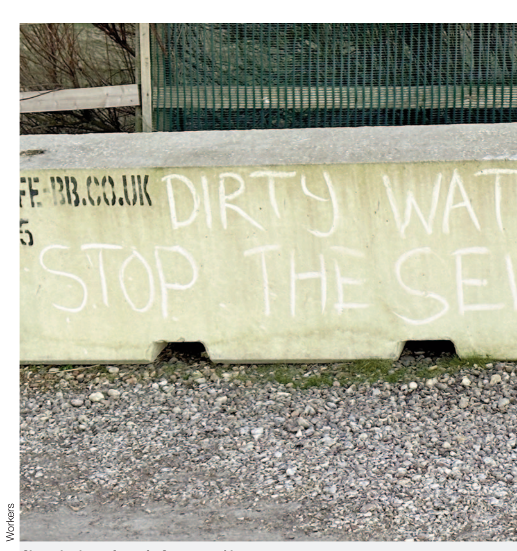
Slogan by the seafront of a Sussex seaside town.

The industry regulator, Ofwat, has put Thames Water into a "special measures" regime. This does not mean customers' money will be invested in stopping sewage