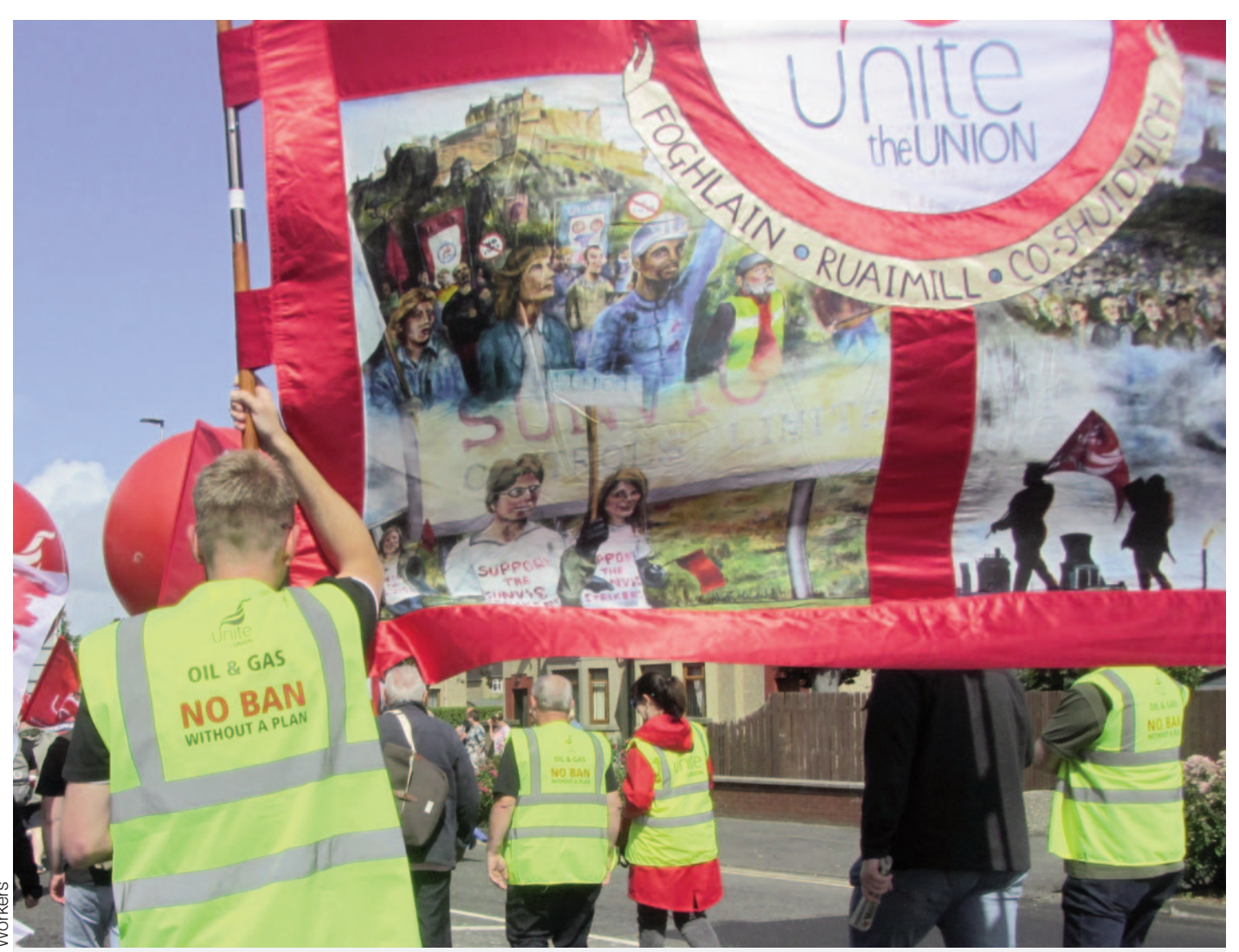
Oil and gas: no ban without a plan. Slogan at an August demonstration at Grangemouth.

"EVERYONE KEEPS saying it's going to go green. There's opportunities out there but nobody just seems to want to put their name or put a policy to it....."