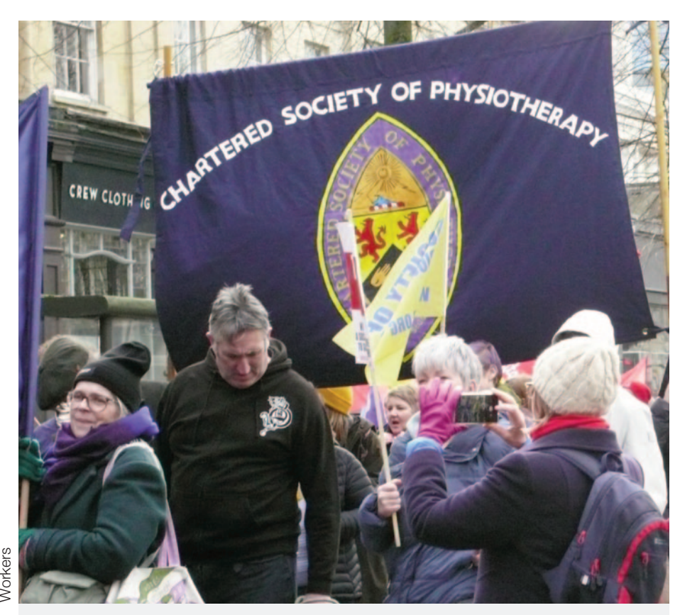
Members of the Chartered Society of Physiotherapy on the TUC demonstration in Cheltenham in January. At the TUC in September they backed a motion congratulating all unions that took action over pay restraint in the public sector.

MANY TRADE union leaders and delegates at this year's TUC Congress in September were predictably rather starry-eyed about the future following the election of a Labour government. But it wasn't all that way.