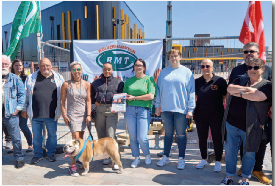
RMT pickets, Wolverhampton, May 2023.