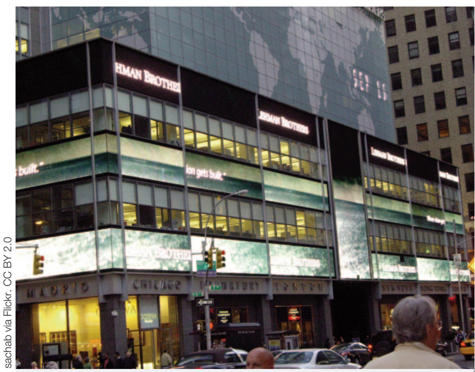
Lehman Brothers offices in New York before the crash.

THE NATIONAL THEATRE has revived its production of The Lehman Trilogy for a limited run. This award-winning play illustrates what Marx and Lenin taught us – that the accumulation of capital and its expansion into an imperialist financial system leads to crisis upon crisis, boom and bust, until even capitalists like the Lehman Brothers can't survive.