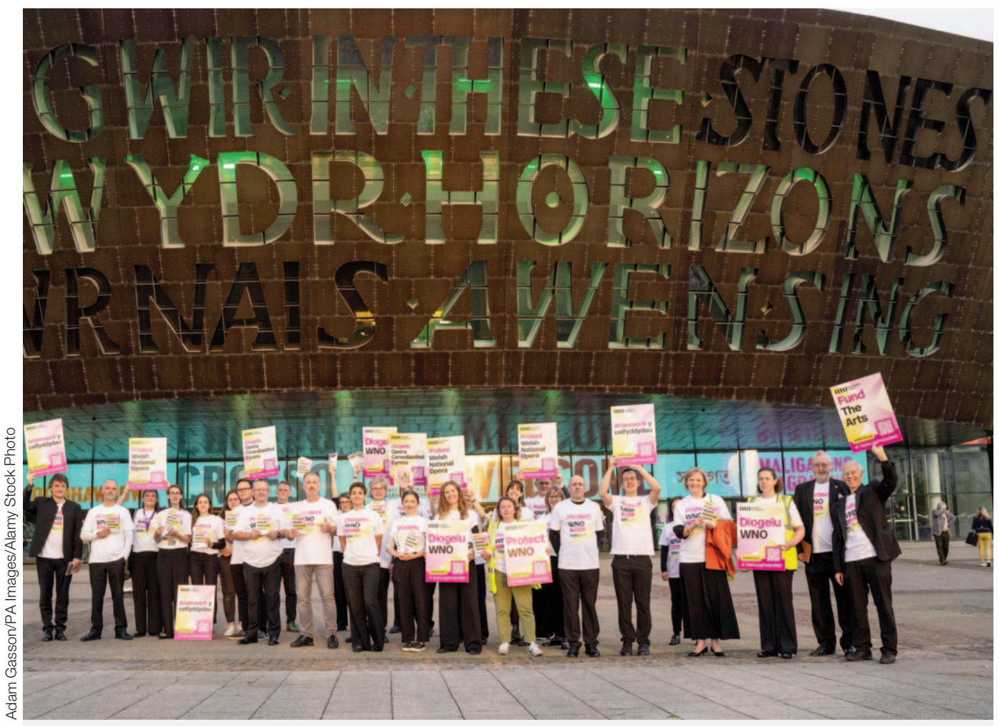
September 2024: Musicians' Union members in the Welsh National Opera orchestra take part in industrial action ahead of a performance of Rigoletto at the Wales Millennium Centre.

CHRONIC CUTS to funding of all aspects of the arts have long been causing deep concern to those working in the creative industries. In recent months the response from workers has been to organise colourful and vigorous campaigns and protests which have successfully grabbed the public's attention.