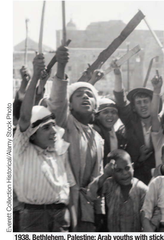
barracks and post office.

In November a demonstration in Trafalgar Square against the war was so huge that it spilled down Whitehall and filled all the streets leading off it. As a result of the opposition, the Cabinet forced Eden to call a cease-fire. The "mad imperialist gamble" (in the words of the foreign affairs' minster, Anthony Nutting, who then resigned) was