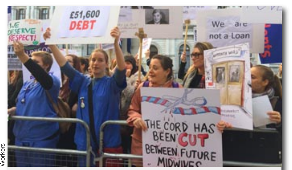
Medical students demonstrating outside the Department of Health at the end of 2015.