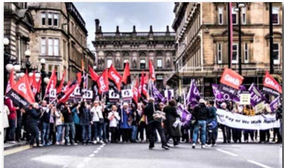
Council workers in Glasgow demonstrate for equal pay.

The Society of Motor Manufacturers and Traders said the 2040 target was "already extremely challenging".