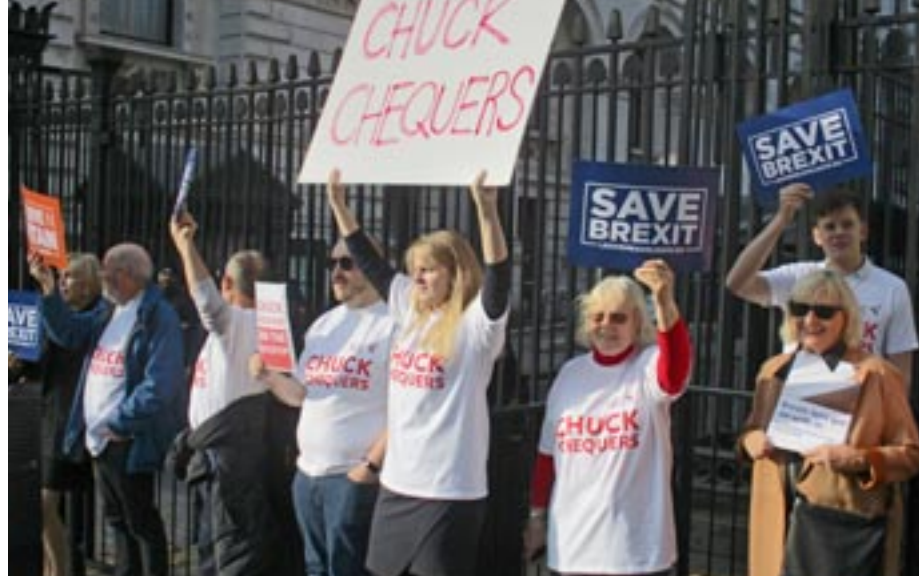
Tuesday 16 October: London Brexiteers take their message to Downing Street.

Visit cpbml.org.uk to sign up to your free regular copy of the CPBML's electronic newsletter, delivered to your email inbox. The sign-up form is at the foot of every website page – an email address is all that's required.