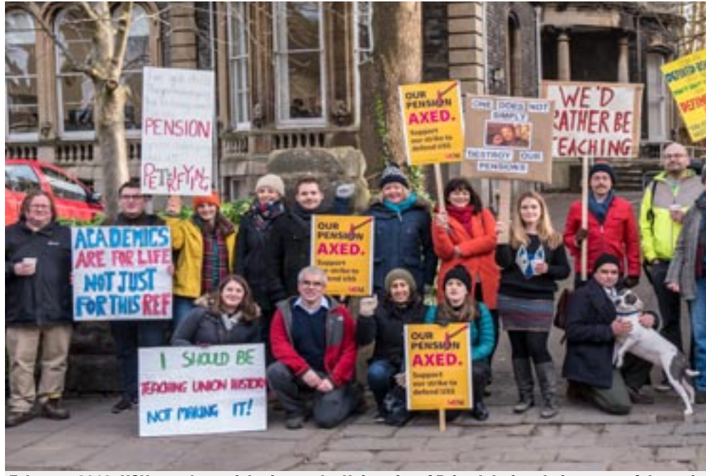
February 2018: UCU members picketing at the University of Bristol during their successful pension

And yet there's no reason at all for increases in contributions, nor for cuts in benefits. In fact, based on interest rate history, the scheme can remain open to new joiners indefinitely.