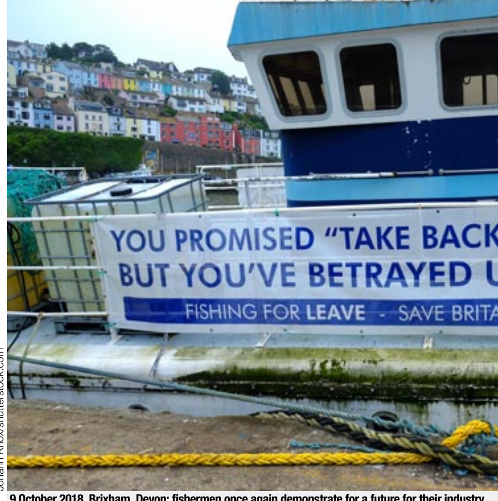
9 October 2018, Brixham, Devon: fishermen once again demonstrate for a future for their industry.

• This article is an edited version of a speech given at a CPBML meeting in London on 17 October.