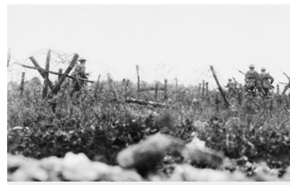
British infantry from The Wiltshire Regiment attacking near Thiepval, 7 August 1916, during the

The world war was not entered into by belligerent rulers to defend "plucky Belgium" or to protect Serbia. These were just helpful excuses to hide the deeper currents at work