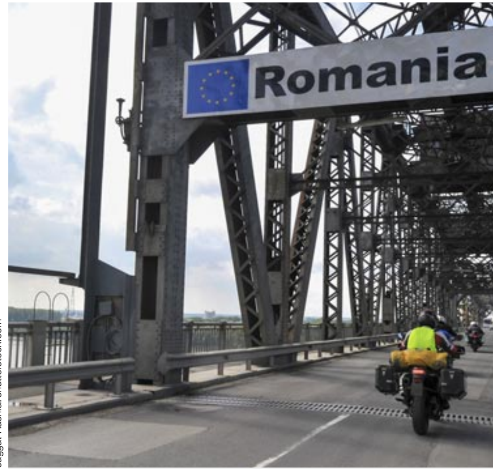
Romanian border with Bulgaria.

'For all the talk of an NHS crisis when Britain leaves the EU, the real crisis is in countries such as Romania.'