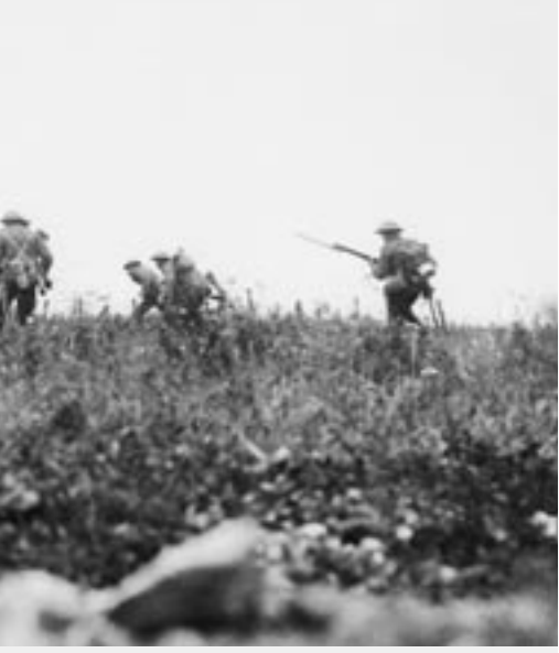
Battle of the Somme.

twenty minutes. The Sheffield City battalion suffered 495 dead and wounded in one day. Such dreadful losses were all too frequent.