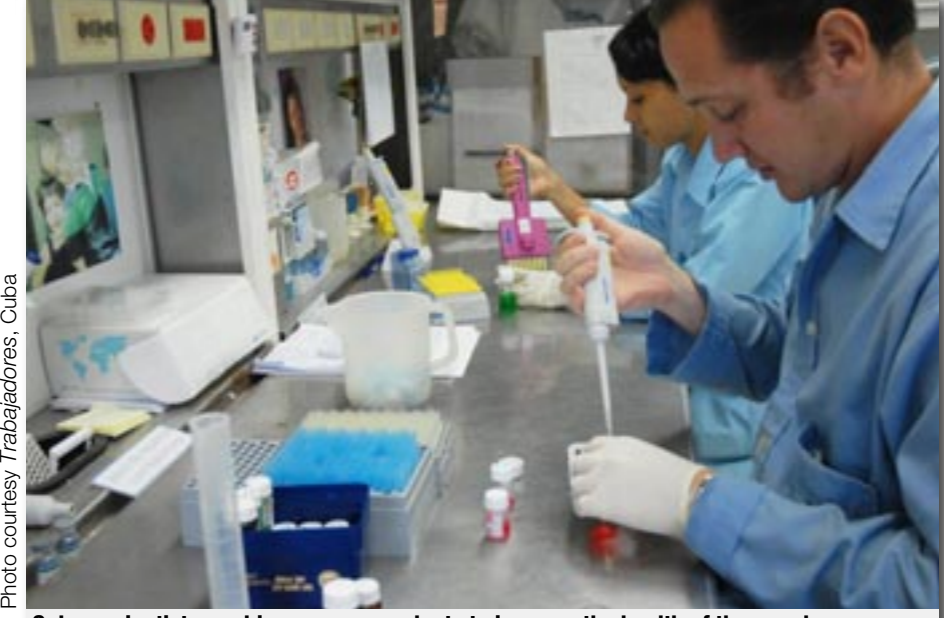
Cuban scientists working on new products to improve the health of the people.

The US has a vast and established biotech industry, with world-leading universities. China has publicly declared it wants to be the industry's world leader by 2025. Forget the EU (happy thought!). If Britain is to compete into the future, leaving the EU can only be the starting point. Such a vital industry cannot be left to the vagaries and failures of "the market": as a country we must control all the levers of economic and financial power.