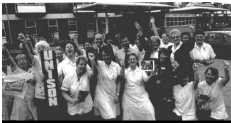
Winning: housekeepers at Bury St. Edmunds celebrate victory in their six-year fight.

Oil and gas supplies to most of Europe are currently being supplied by Russia, the Middle East and North Africa. The only indigenous oil and gas supplies are beneath the North Sea. Britain and Norway have