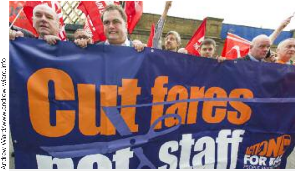
18 August, Waterloo Station: rail unions and the TUC's Action for Rail Campaign demonstrated against the double attack of fare increases and staff cuts.

Visit cpbml.org.uk to sign up to your free regular copy of the CPBML's newsletter delivered to your email inbox.