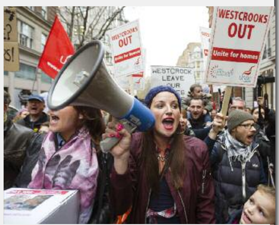
Young and old marched in last year's successful fight to stop the (relatively affordable) New Era housing estate being sold to Westbrooks.

The combination of low wages, unemployment and tighter housing markets mean that young people cannot establish independent households. Many young adults now go through a protracted period without traditional family responsibilities, replaced by non-family living. Such difficulties affect their health and well-being and make it increasingly difficult to maintain protective social relationships.