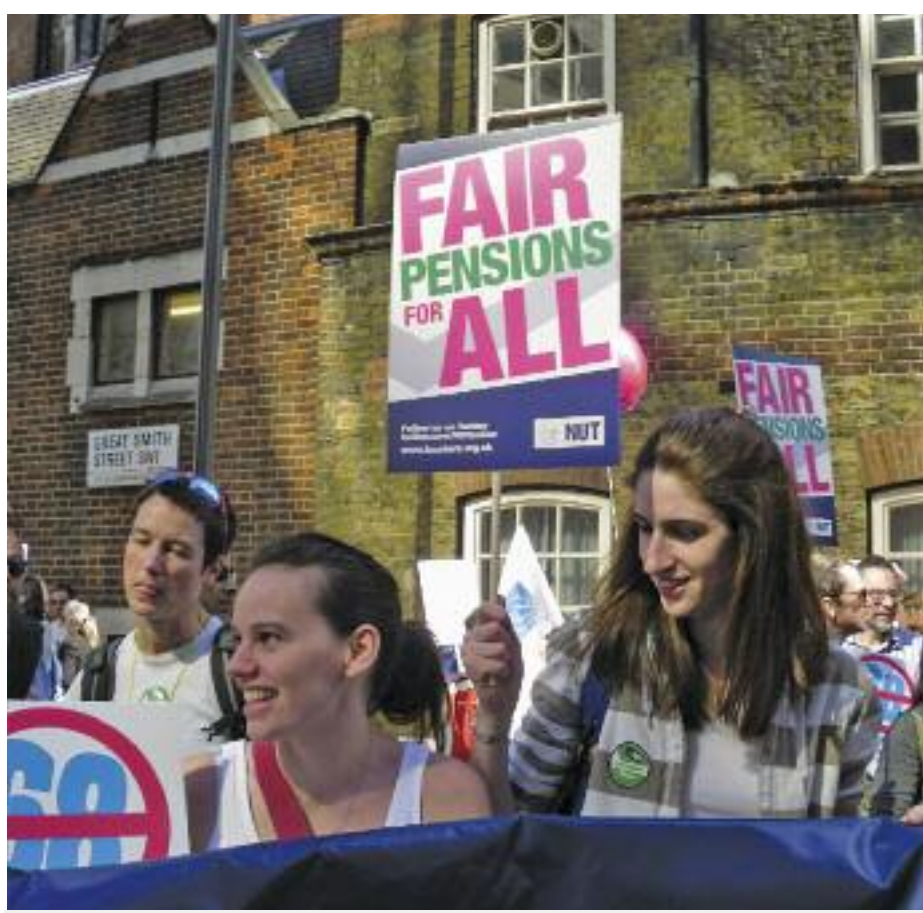
Young NUT members marching for pensions, 28 March 2012.

WORKERS LEAVING school or university now have to pay individually to fund a non-guaranteed pension due in forty years' time. That would seem an odd idea to previous generations of British workers.