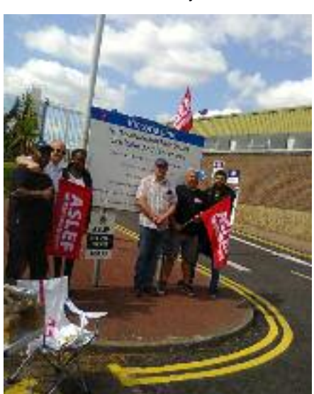
Unity (before the division): Aslef members picket the Northumberland Park depot on 9 July.

The RMT and TSSA have been particularly critical of the safety issues relating to the introduction of the night tube. Johnson wants a night tube on the cheap, and seems hell bent on putting the lives of both staff and passengers at risk by trying to run the system with minimal staff numbers. Not only will there be few station staff, but there will also be fewer staff in the control centres that monitor the many CCTV cameras essential for a safe and secure rail system.