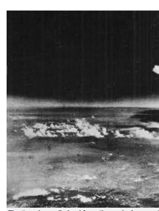
The "mushroom" cloud from the explosion over American plane that dropped the bomb.

'The bomb was directed as much at the USSR as at Japan..'