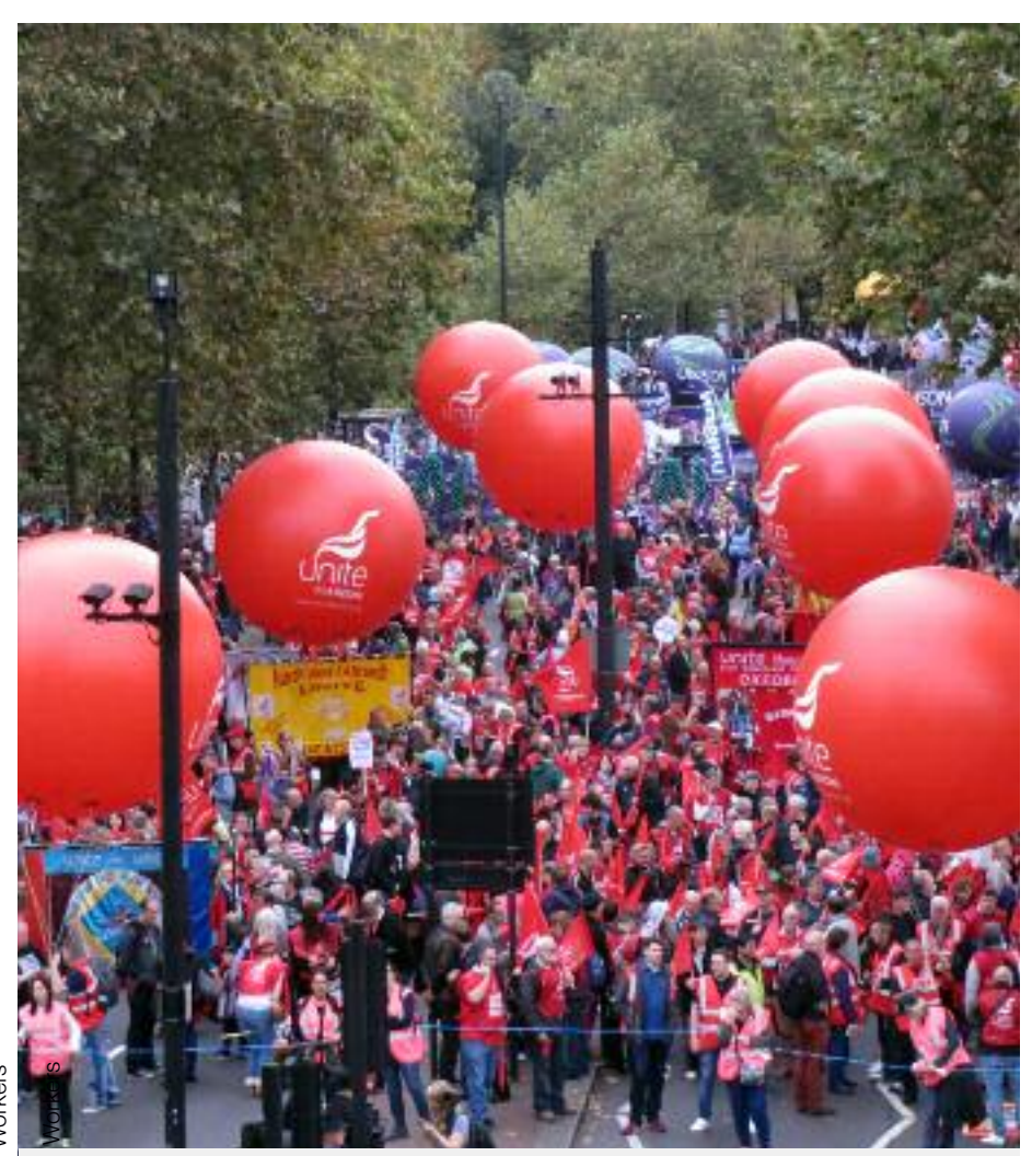
Last autumn's TUC march for pay. This year the fight is about the survival of unions.