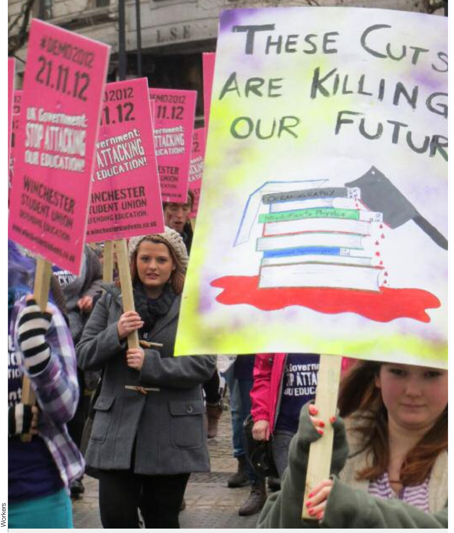
Students marching in London in 2012 against the outrageous fees charged for university education.

lated internships. And even then they need a degree and parents who are able to support them. Internships are unpaid or at best poorly paid, giving new meaning to wage slavery. It's unclear how many of those tied to internships are included in the unemployment figures.