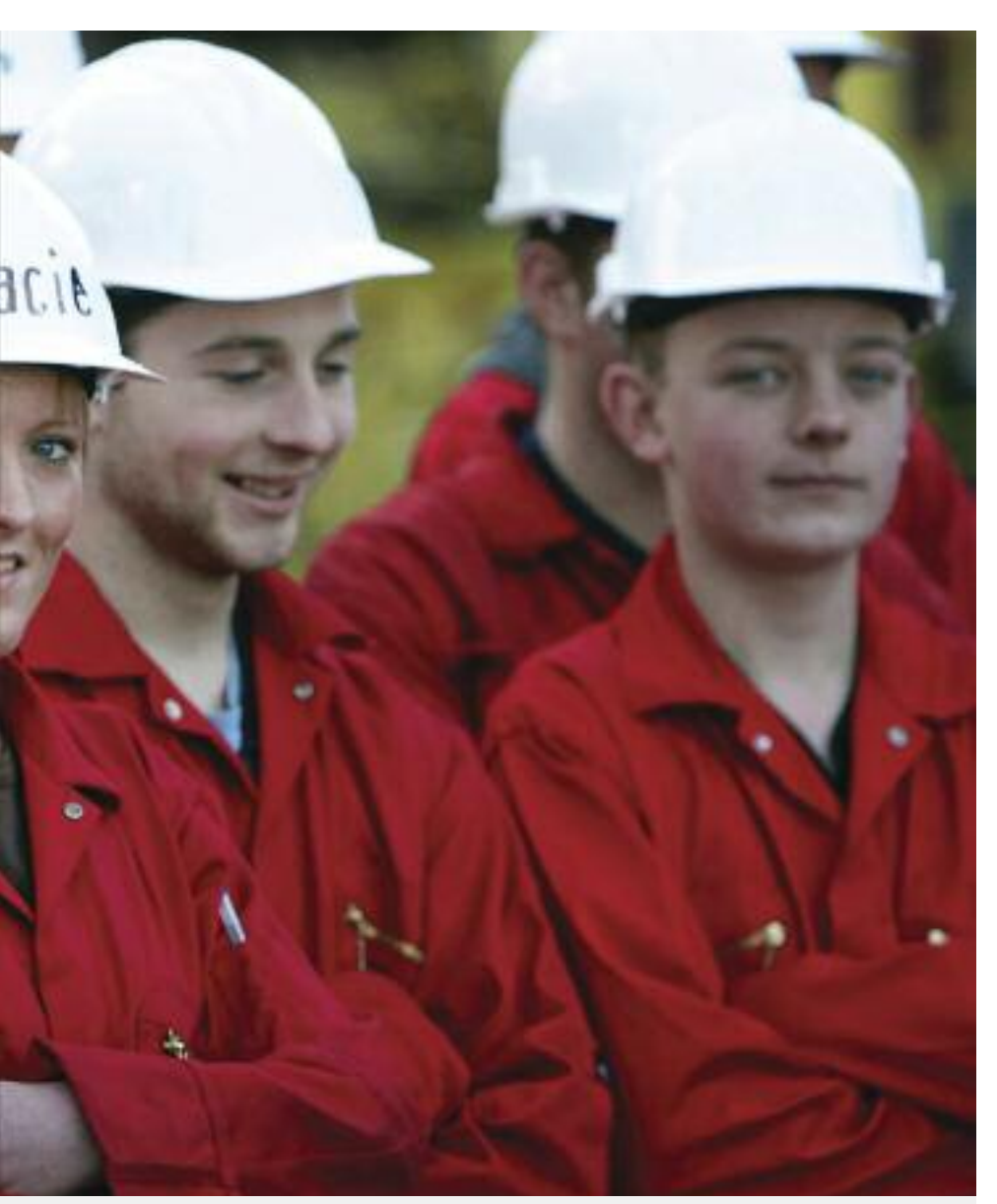
hipyard on Merseyside in December 2008.

Young members are involved at all levels of Unison, including the National Delegate Conference, the supreme policy making forum of the union. Unison, along with Unite and the GMB, is active in "community level" unionism, trying to encourage young unemployed people to join a union. But this is a shabby substitute for workplace organising and getting into workplaces where trade unions have been derecognised. The idea is a direct import from the