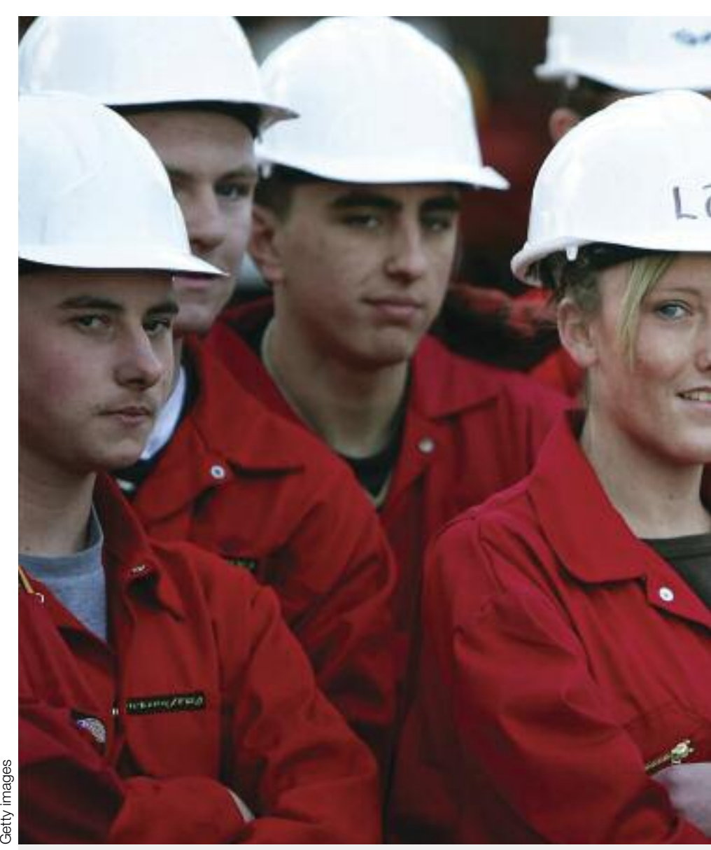
All too rare a sight: part of a group of 20 apprentices taken on for proper training by Cammell Laird's

With these issues in mind, unions have attempted to create a "portable" or "open source" form of union membership for workers, cheaper than full membership, and moving with the worker between transitory