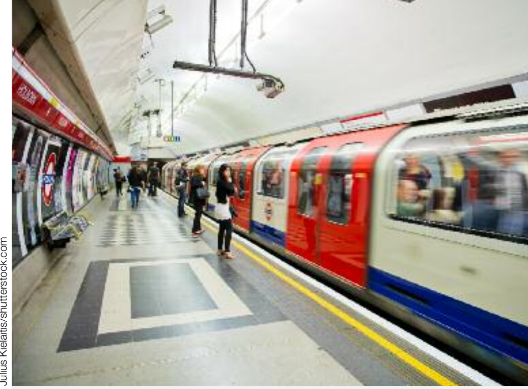
The Central Line at the busy Holborn tube station. London Underground says it wants to run a 10-minute service throughout the night.

Recent changes in the senior management team have failed to change the dictatorial approach to industrial relations at London Underground. Instead of negotiating and consulting with the unions over the introduction of the night tube, as has been the norm in the past, management tried to impose new working arrangements which if