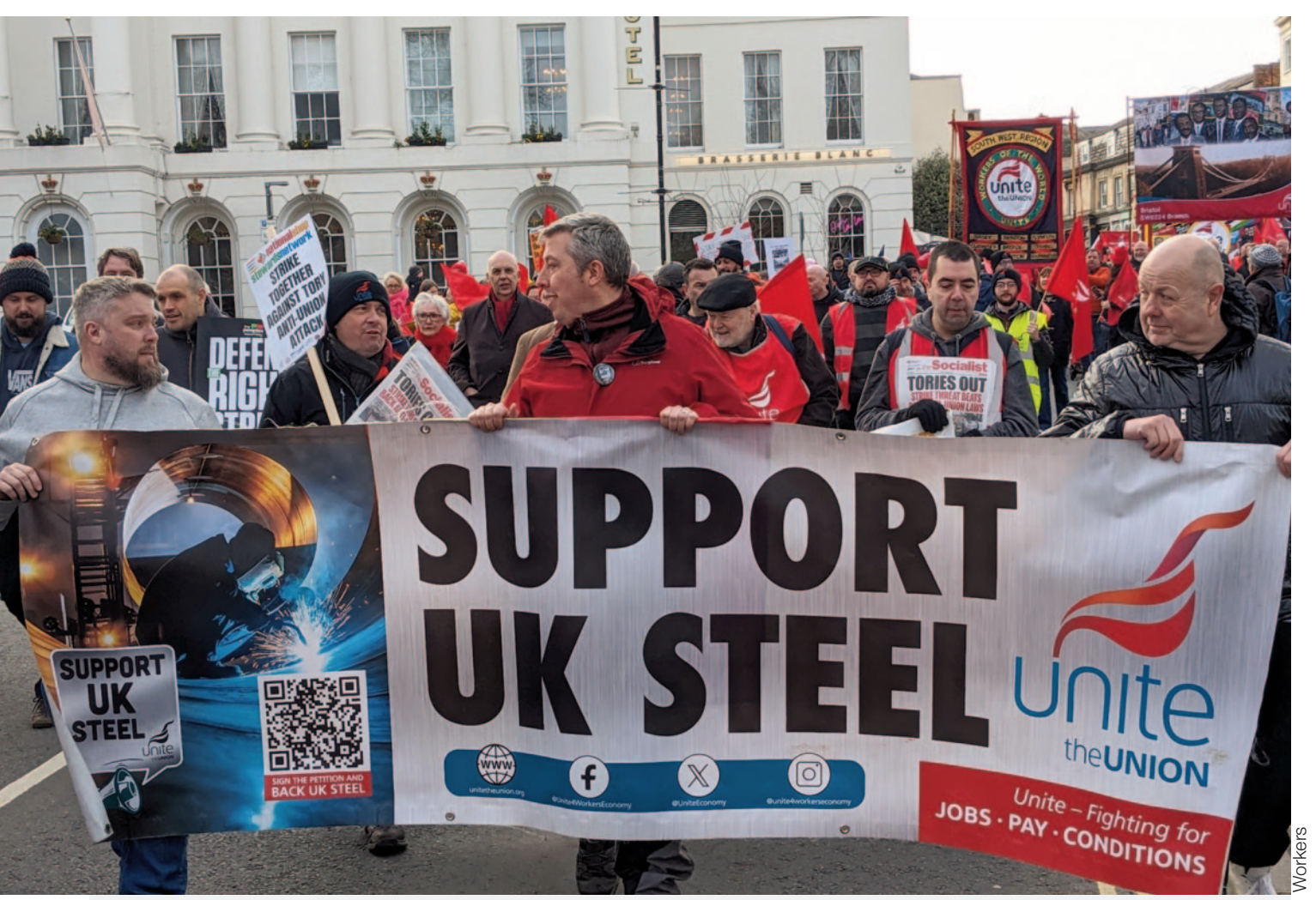
Steel workers marching for their industry, Cheltenham, January 2024.

BRITAIN HAS seen decades of economic stagnation and decline. Investment in production, the basis for true wealth creation, has dwindled. The country's starved infrastructure is in a terrible state. There is neither a strategy nor a fiscal plan to correct