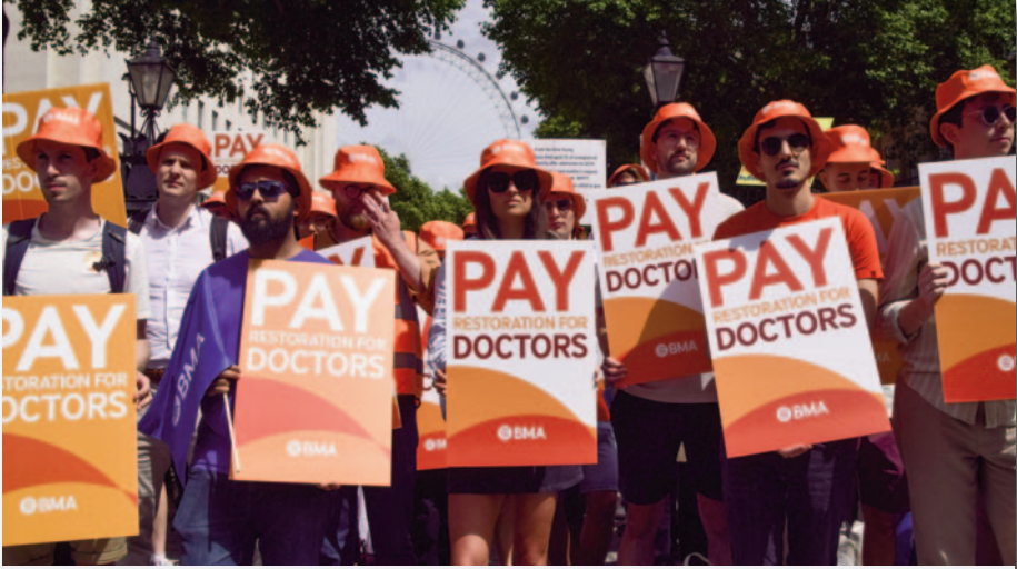
BMA rally, Whitehall, June 2024.

Like its predecessors, Labour is set on making big changes to the rail industry, to working practices, and to conditions of employment.