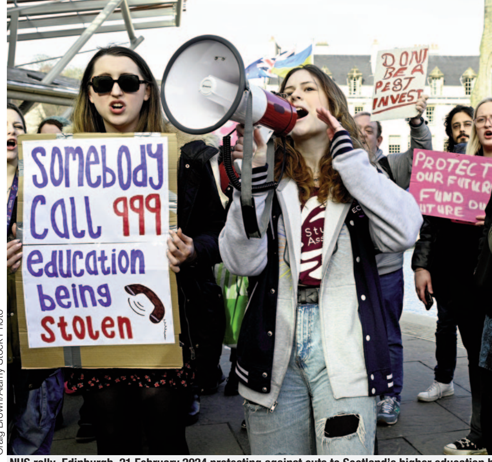
NUS rally, Edinburgh, 21 February 2024 protesting against cuts to Scotland's higher education by

'Students are graduating with a lifetime of debt. Yet spending on staff is at a record low...'