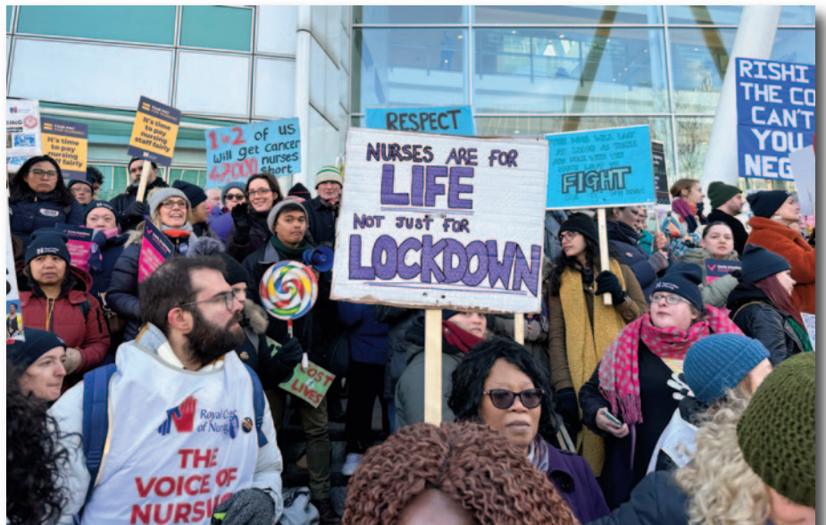
University College Hospital, 2023: nurses fighting for pay.