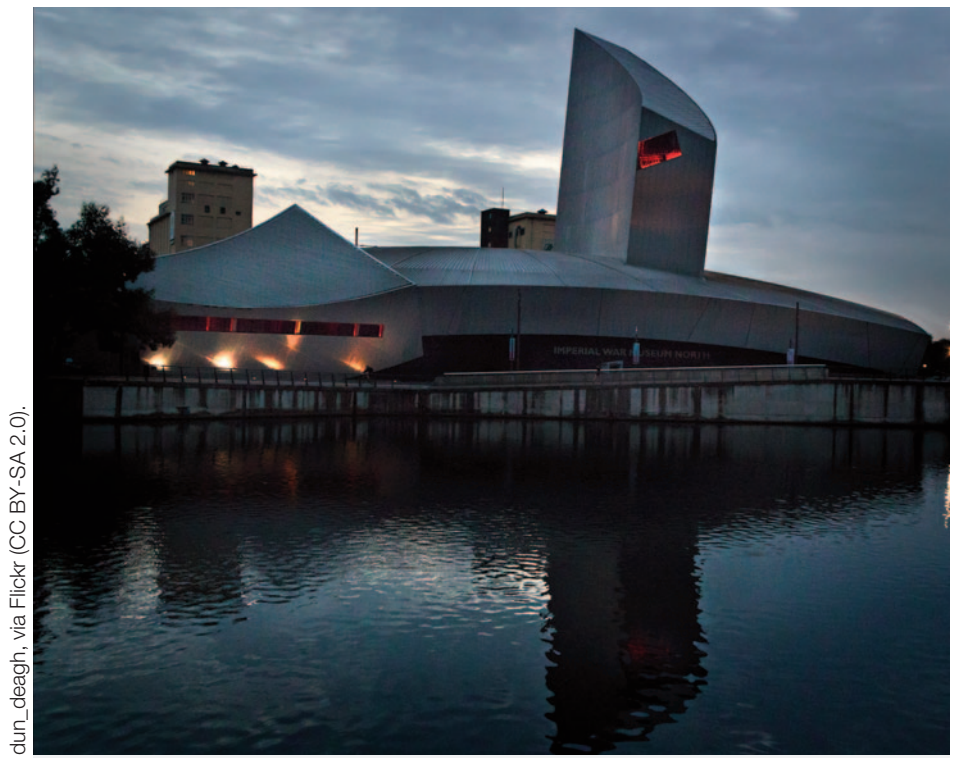
Imperial War Museum North.

AN EXHIBITION at the Imperial War Museum North in Manchester explores how many incidents of the Troubles in northern Ireland, 1969 to 1998, remain highly contested. Called "Living with Troubles', it shows that many people who lived through them have very different perspectives on what happened.